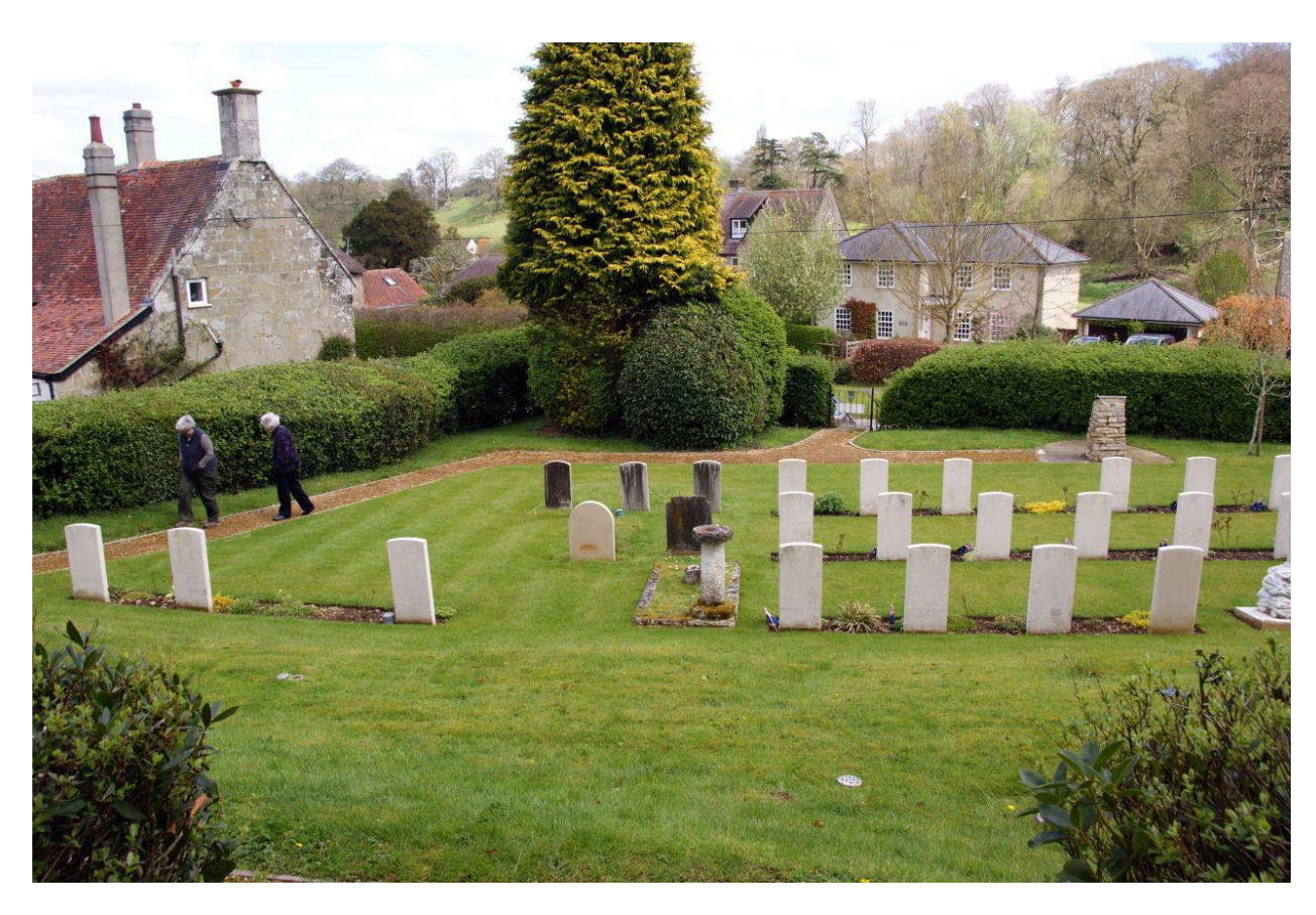
\textbf{Photo taken from back of Cemetery looking towards the Entrance} \ \ \textit{(Photo courtesy of Andrew Stacey)} \\