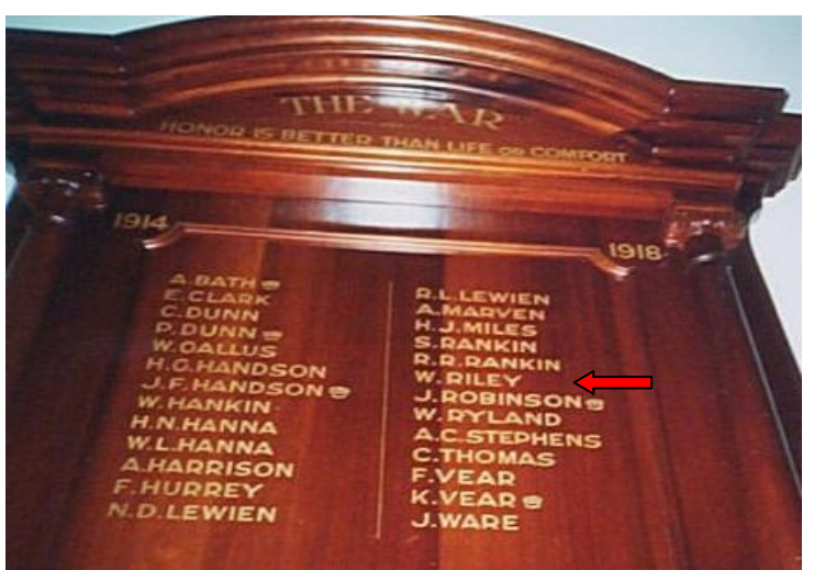
Burwood Methodist Church Honour Roll

W. Riley is remembered on the Burwood Methodist Church Honour Roll, located in Burwood Uniting Church, Warrigal Road, Burwood, Victoria.