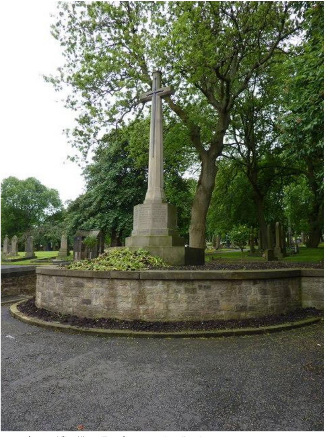
Cross of Sacrifice – East Cemetery, Gateshead

The Cross of Sacrifice, built of Stancliffe stone, was erected after the 1914-1918 War and stands inside the cemetery entrance. It commemorates not only the servicemen buried here, but also those buried in Gateshead (Saltwell) Cemetery.