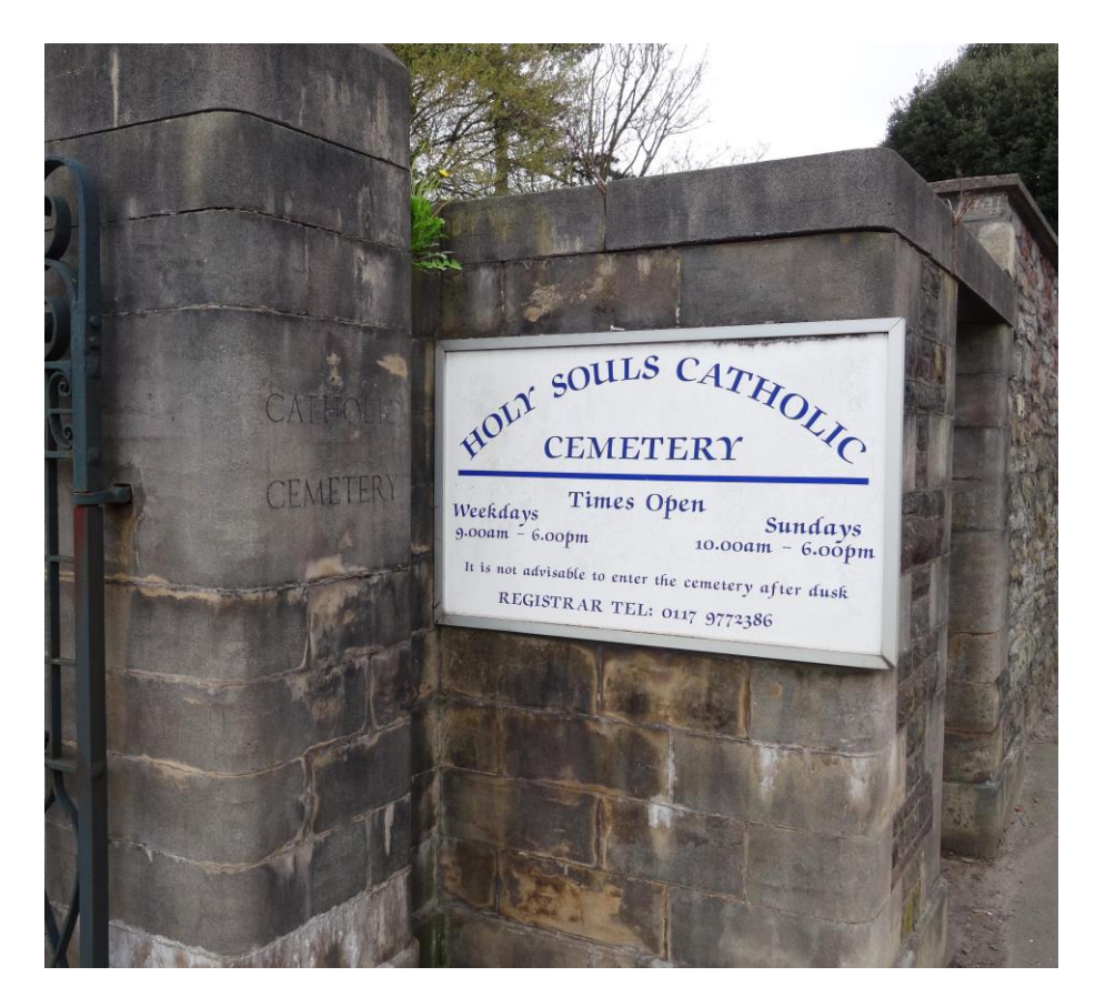
Holy Souls Roman Catholic Cemetery