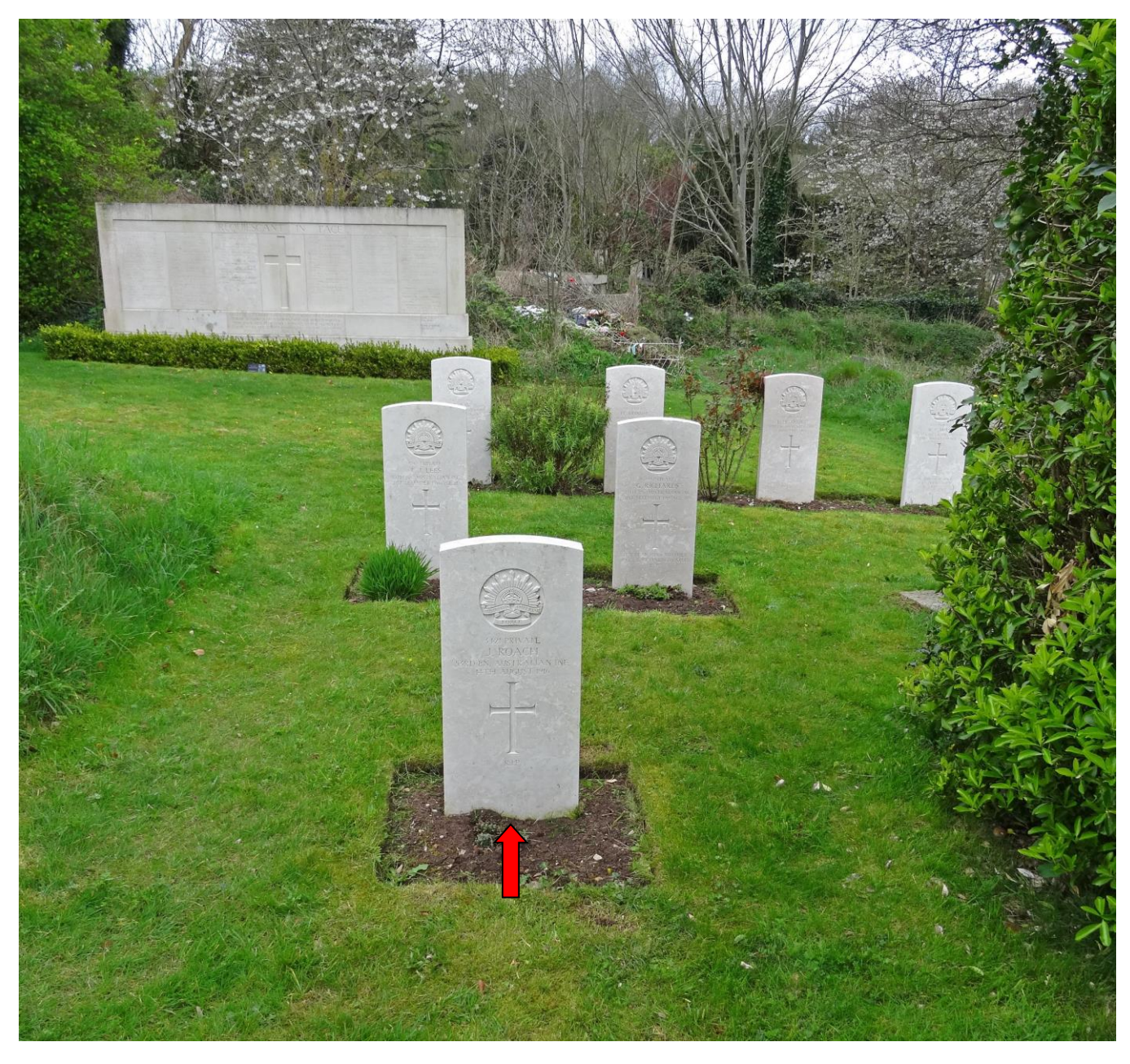
Australian World War 1 CWGC Headstones in Holy Souls Roman Catholic Cemetery Private J. Roach – Front row