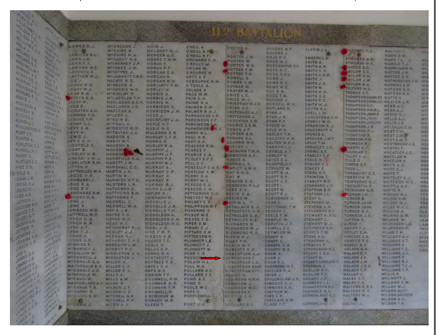
11th Battalion Panel