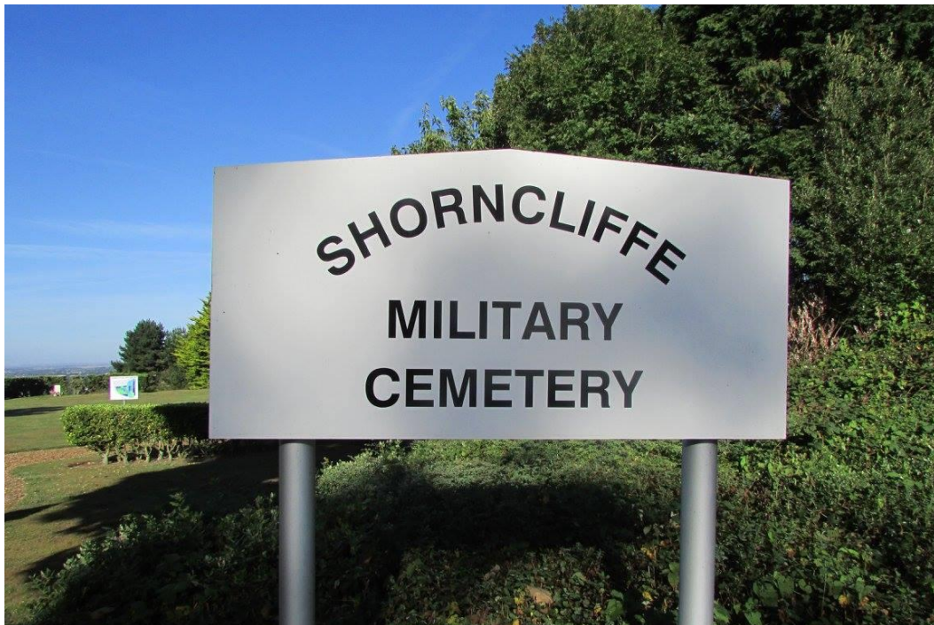
Shorncliffe Military Cemetery, Folkestone