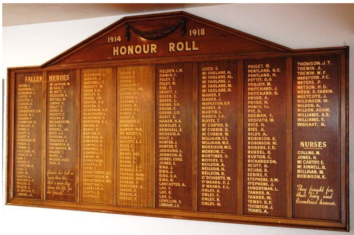
Traralgon Honour Roll