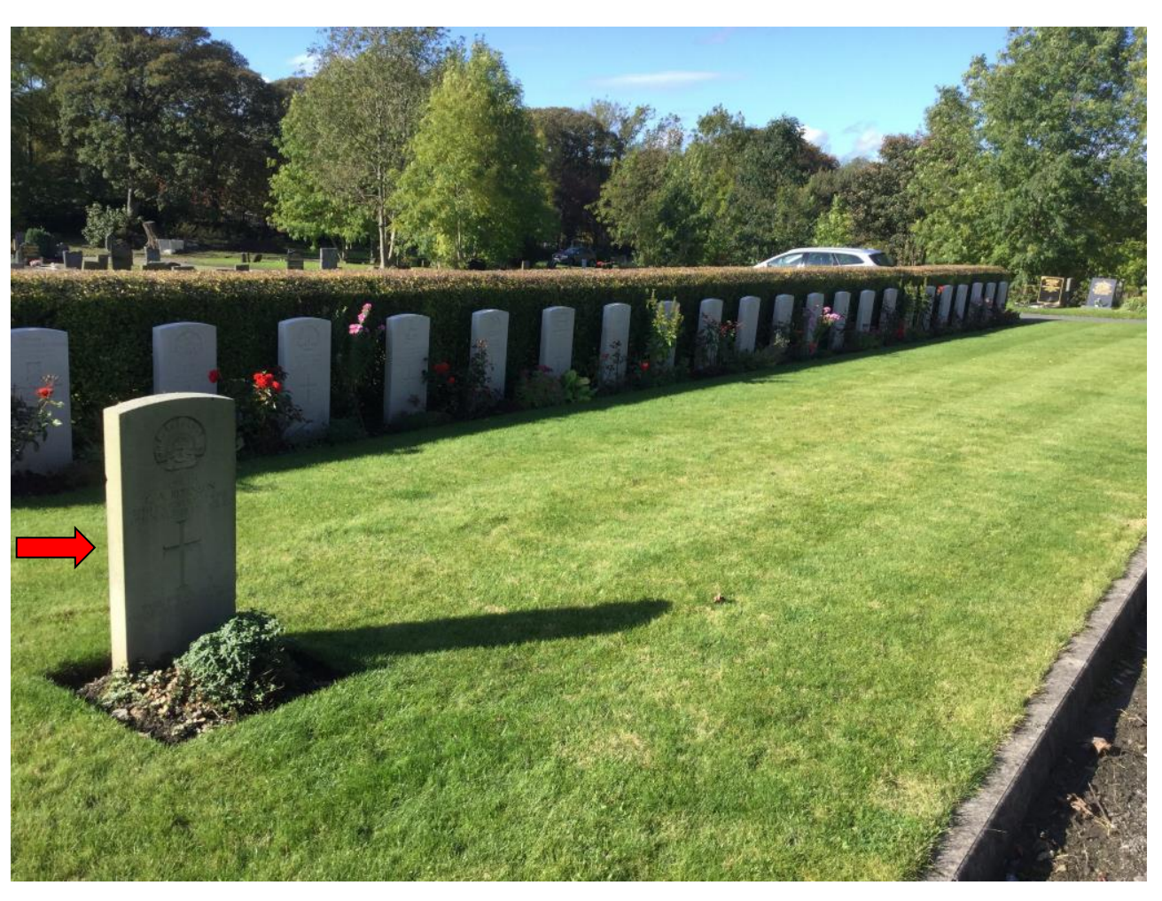
\textbf{Lance Corporal C. A. Robinson's CWGC Headstone marked with red arrow}