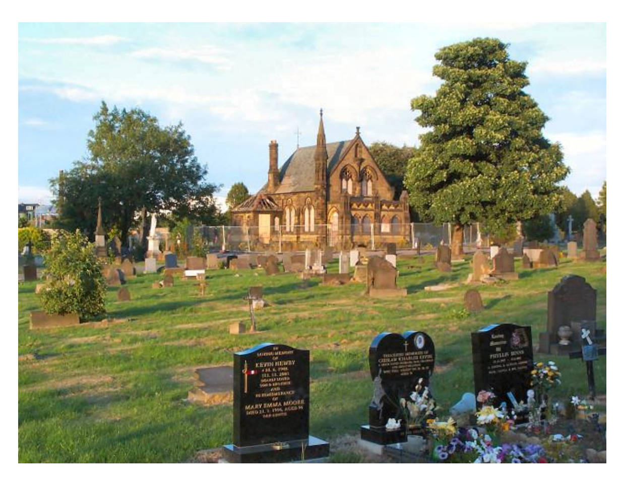
Chapel in Bowling Cemetery