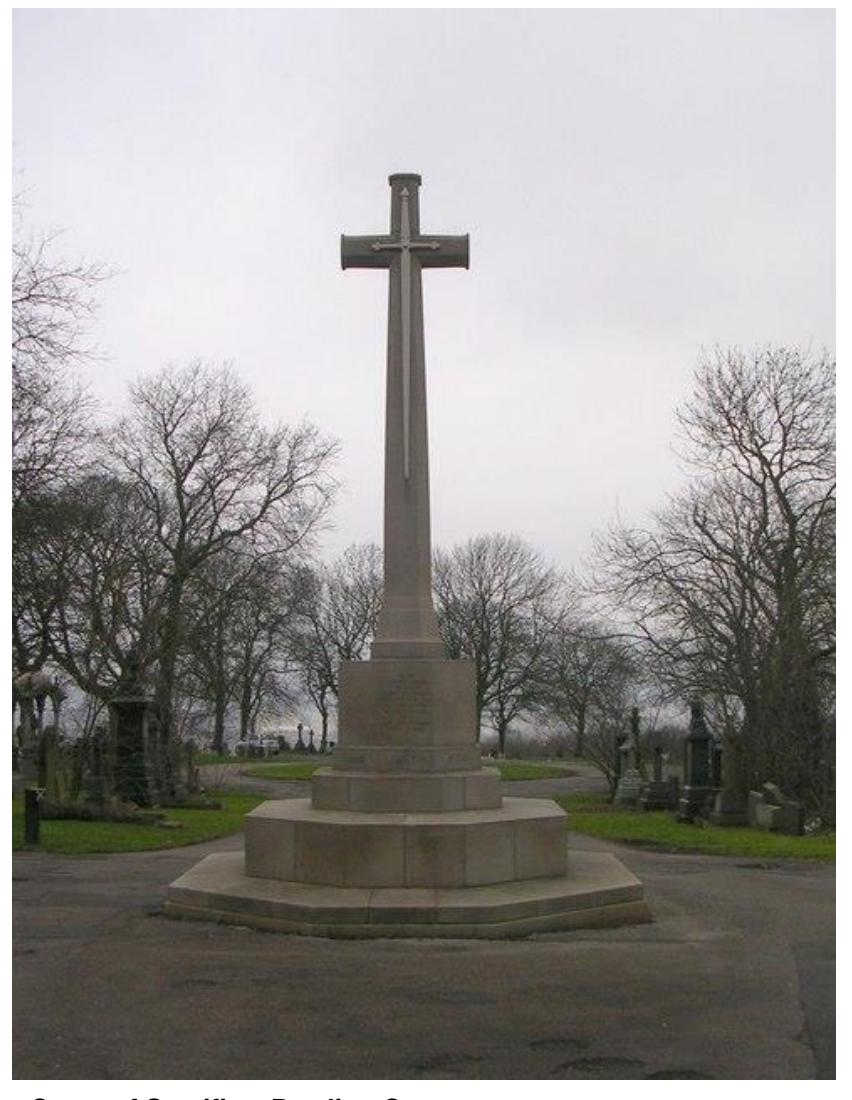
Cross of Sacrifice, Bowling Cemetery