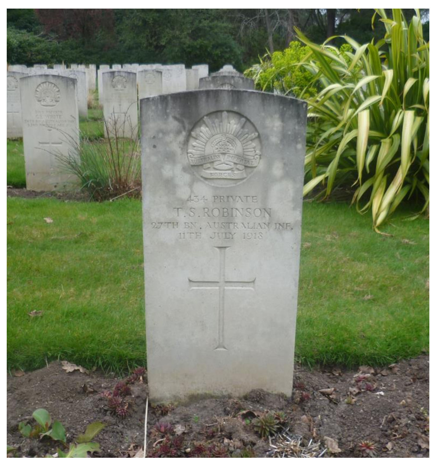
Photo of Private T. S. Robinson's Commonwealth War Graves Commission Headstone in Brookwood Military Cemetery, Surrey, England.