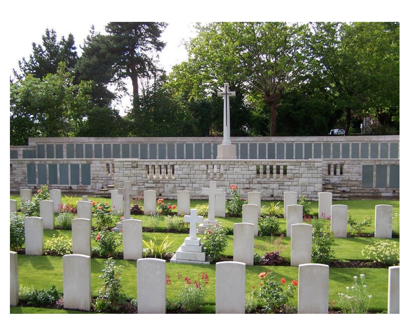
CWGC Graves in Hollybrook Cemetery with Cross of Sacrifice & Hollybrook Memorial