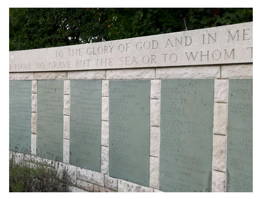
Name Panels behind Cross of Sacrifice