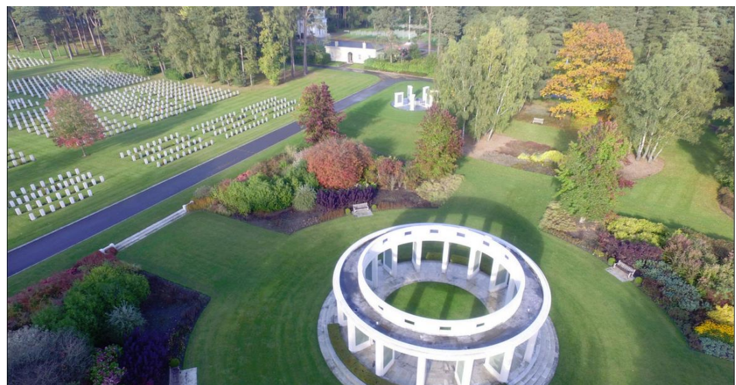
Brookwood Military Cemetery

There are 446 Australian War Graves in Brookwood Military Cemetery – 351 from World War 1 & 95 from World War 2.