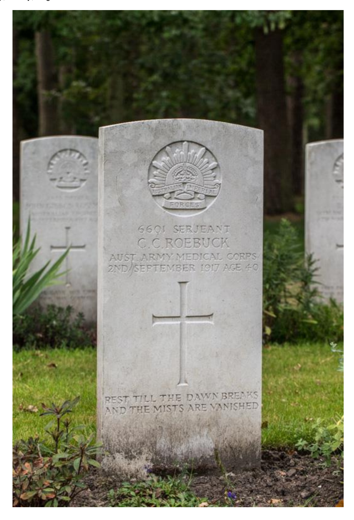
Photo of Serjeant C. C. Roebuck's Commonwealth War Graves Commission Headstone in Brookwood Military Cemetery, Surrey, England.