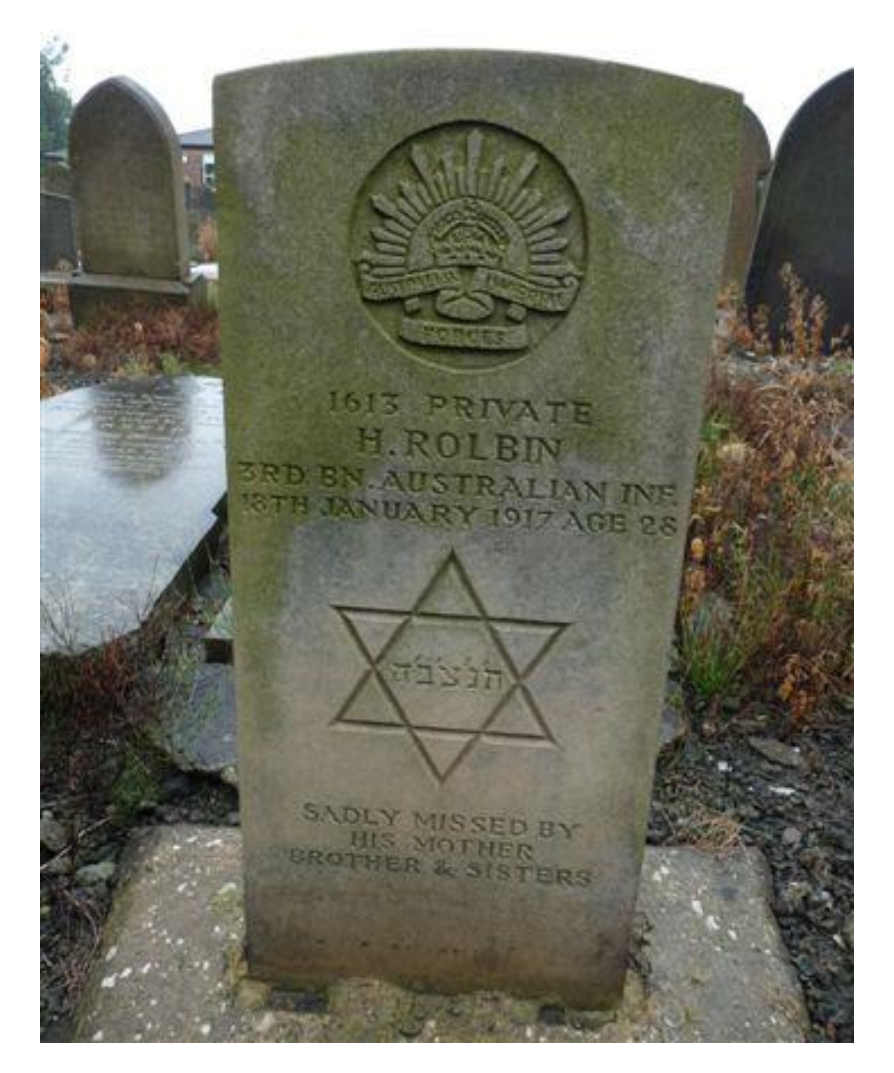
Photo of Pte H. Rolbin's Commonwealth War Graves Commission Headstone in Blackley Jewish Cemetery, Blackley, Manchester, Lancashire, England.