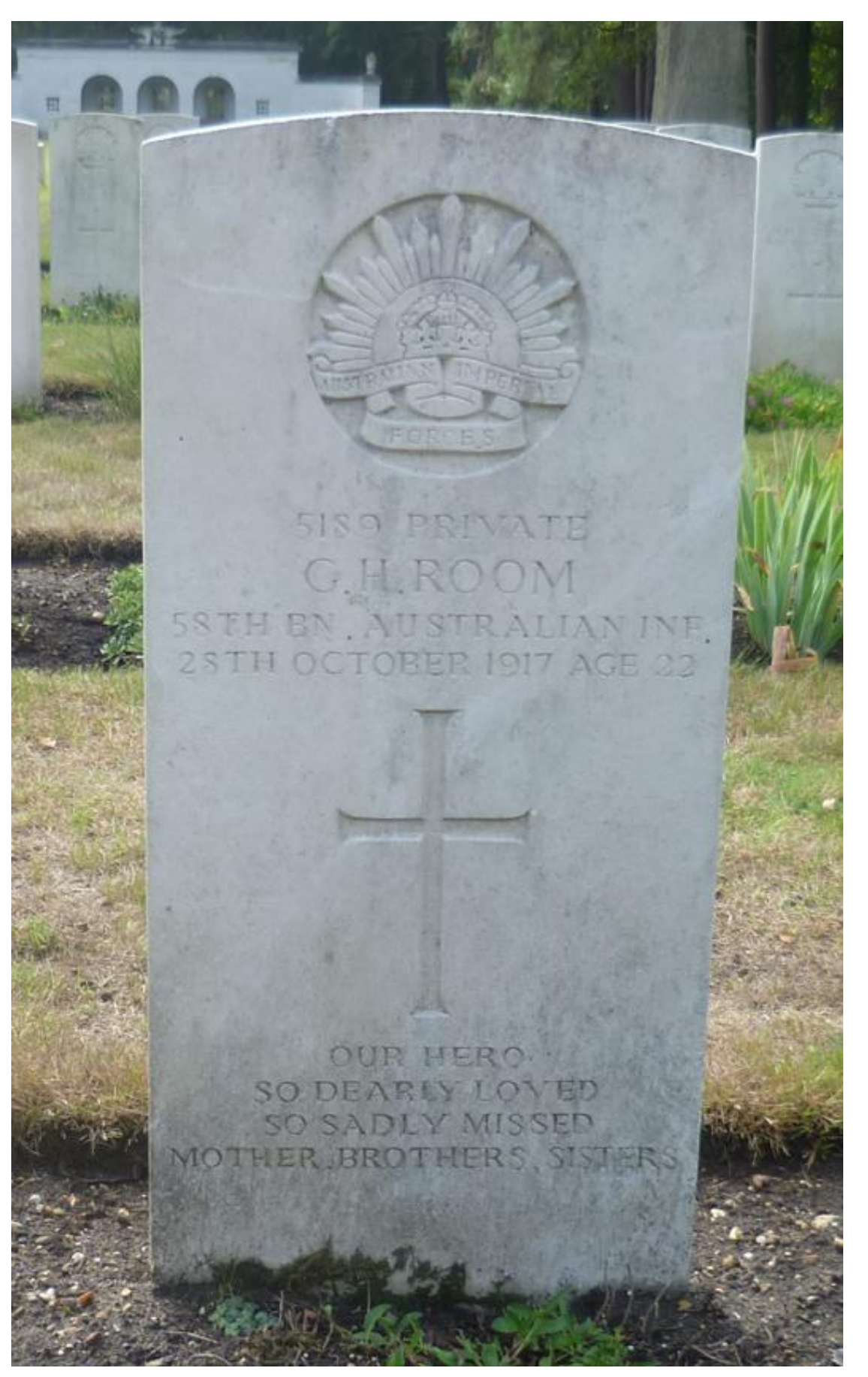
Photo of Private G. H. Room's Commonwealth War Graves Commission Headstone in Brookwood Military Cemetery, Surrey, England.