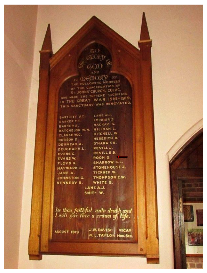
St. John's Honour Roll