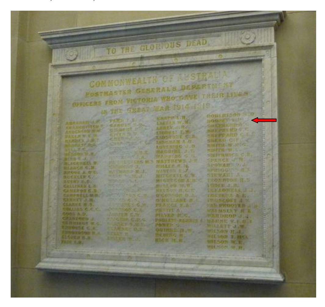
General Post Office Honour Roll, Melbourne