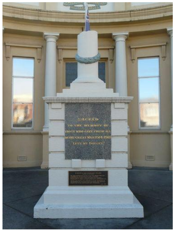
The Northcote Cenotaph

The Northcote Cenotaph does not record individual names.