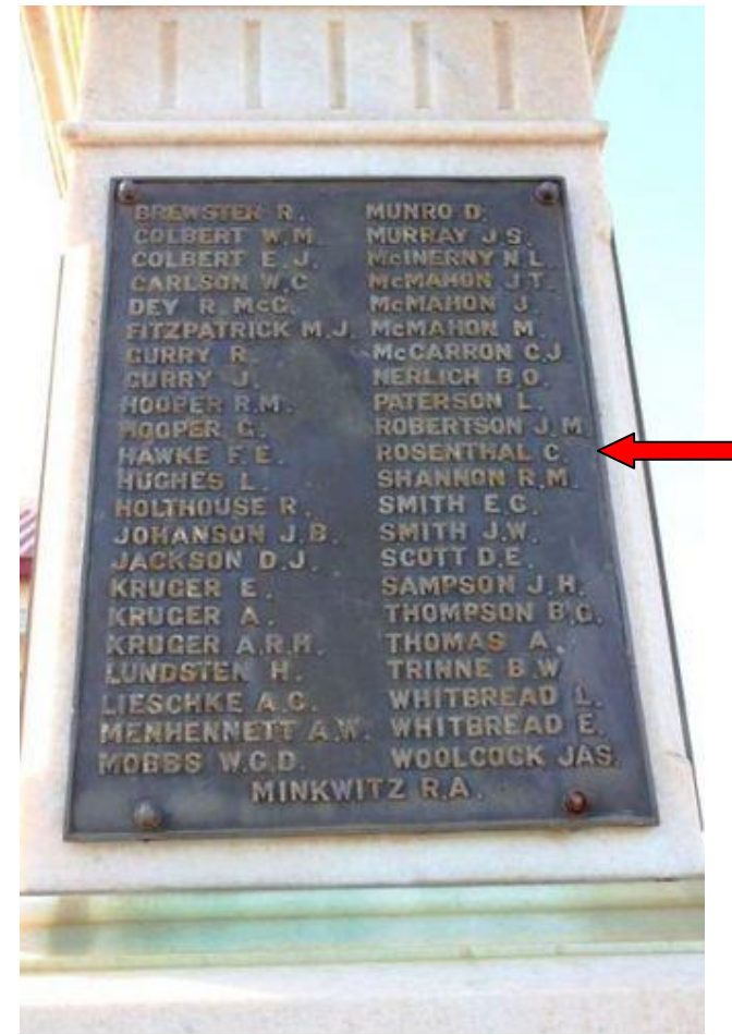
Kapunda War Memorial