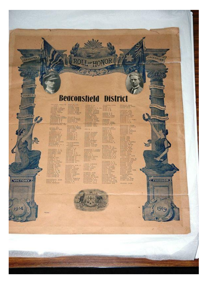
Beaconsfield District Roll of Honour

C. H. Rosevear is remembered on the Beaconsfield District Roll of Honour located in Beaconsfield Museum, West Street, Beaconsfield, Tasmania.