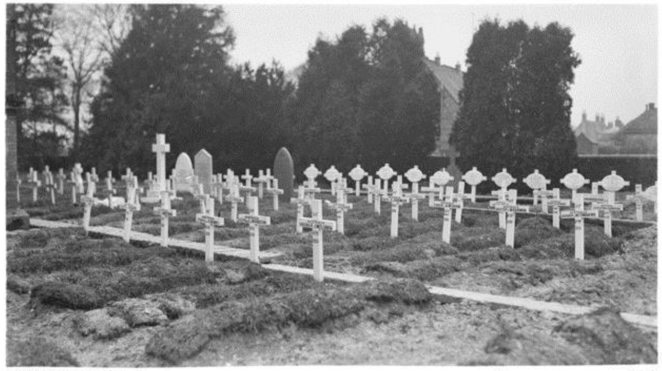
AUSTRALIAN WAR MEMORIAL D00388