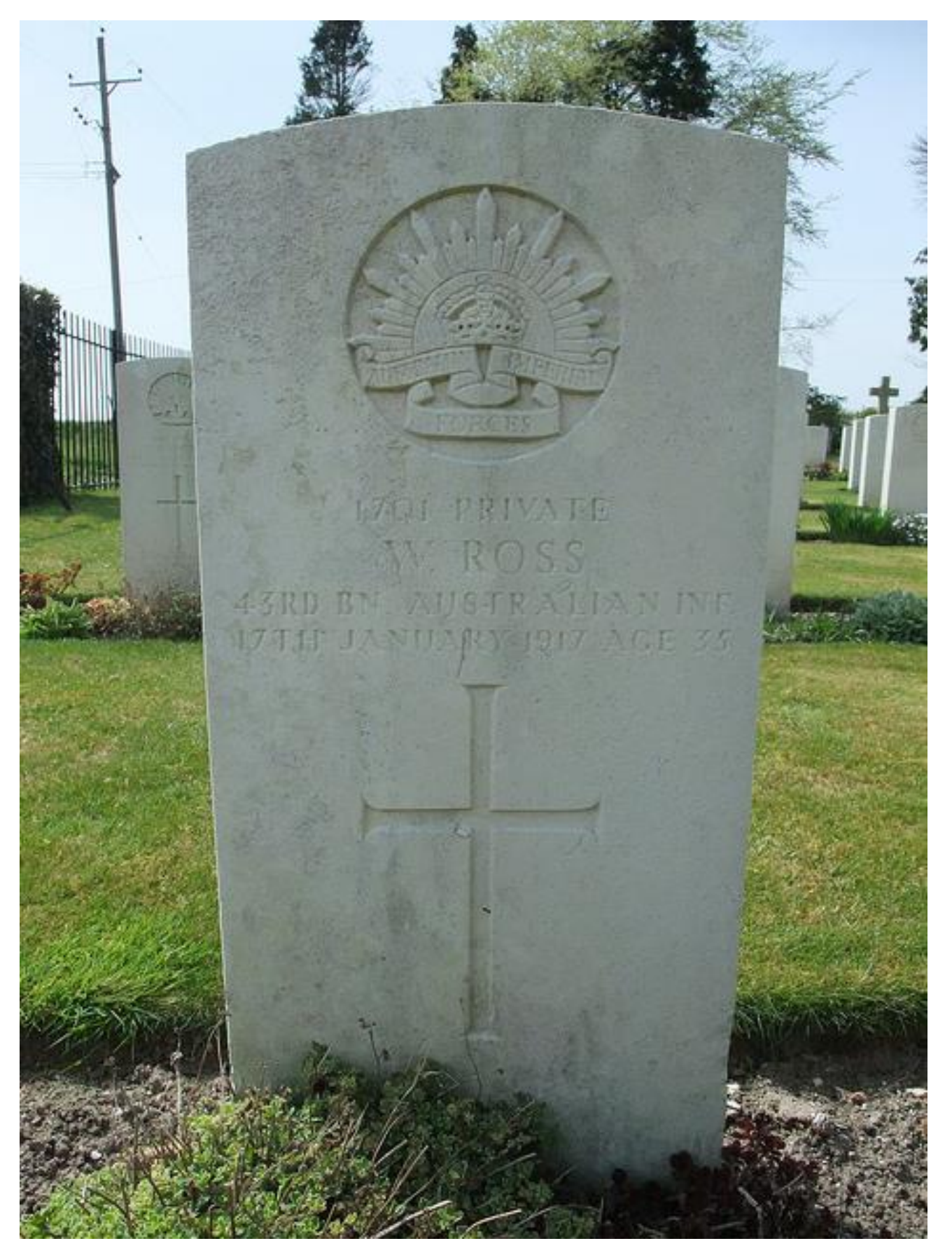
Photo of Pte W. Ross's Headstone at Durrington Cemetery, Wiltshire.