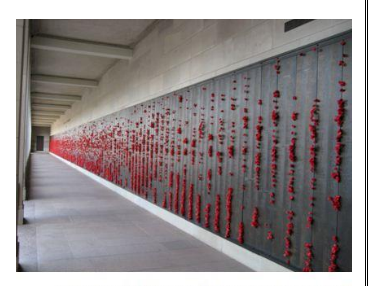
Roll Of Honour WW1 Australian War Memorial Canberra, Australia

Pte W. Ross is also remembered on the South Australian National War Memorial, located on corner North Terrace and Kintore Avenue, Adelaide. (Panel 7, column 2)