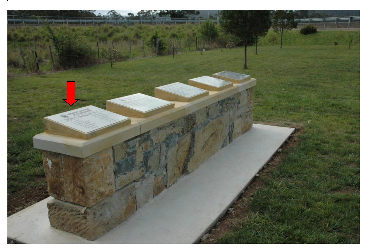
Triabunna Remembrance Plaques