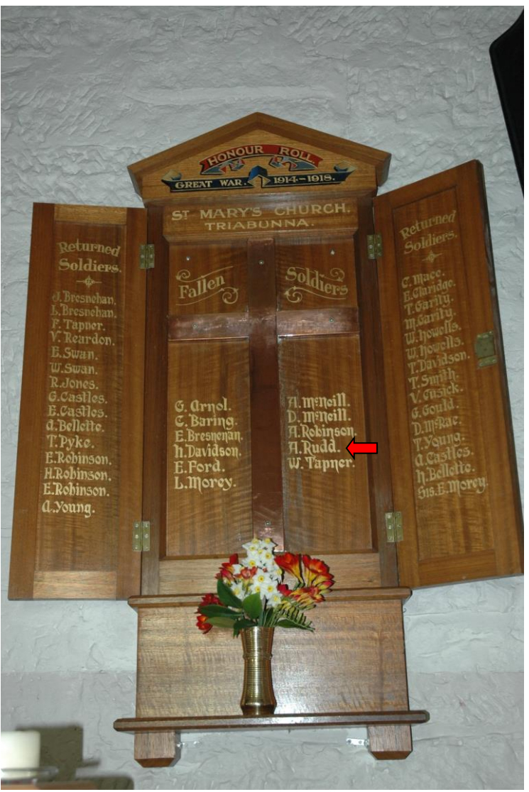
St. Mary's Church Triabunna Honour Roll