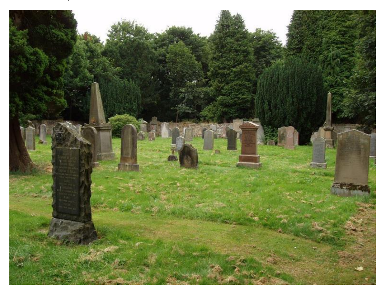
Newbattle Old Cemetery

Newbattle Old Cemetery contains 8 Commonwealth War Graves – all from World War 1.