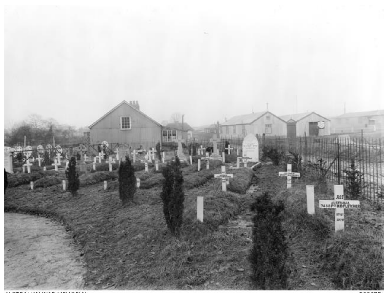
AUSTRALIAN WAR MEMORIAL D00279