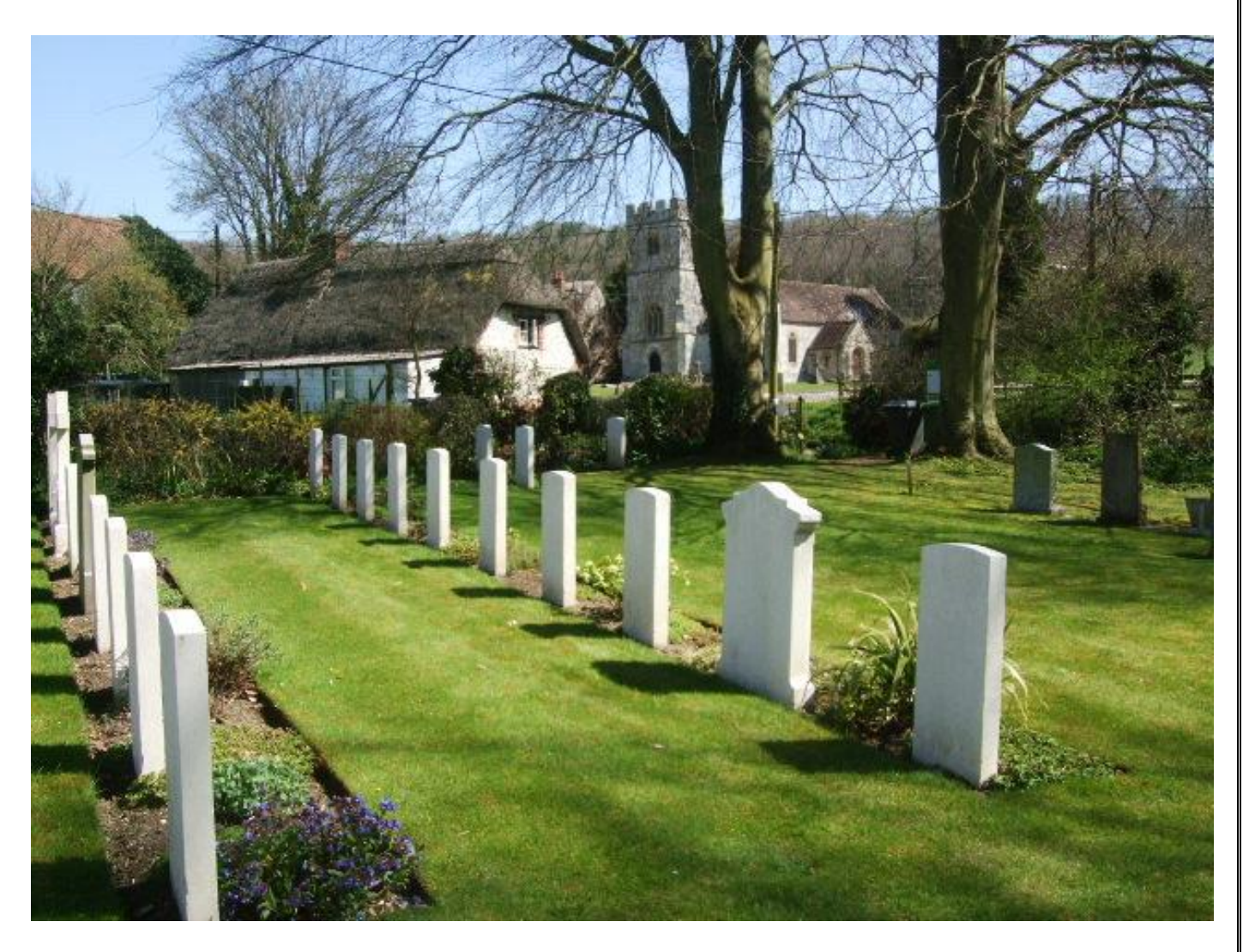
St. Mary's New Churchyard, Codford

There are 31 WW1 Australian War Graves & 66 WW1 New Zealand War Graves located here. There is one WW1 British Royal Army Medical Corp Grave & one WW2 Welsh Guards grave located in this Churchyard.