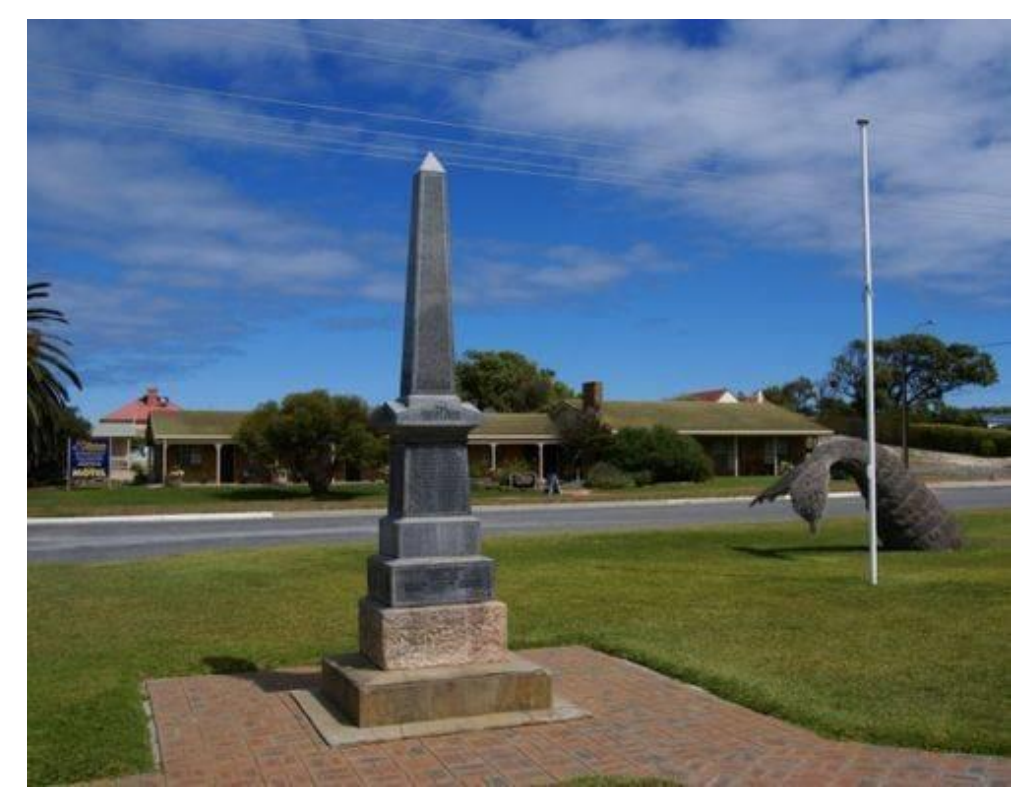
Elliston War Memorial