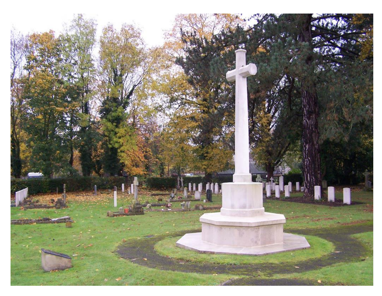
Bulford Church Cemetery