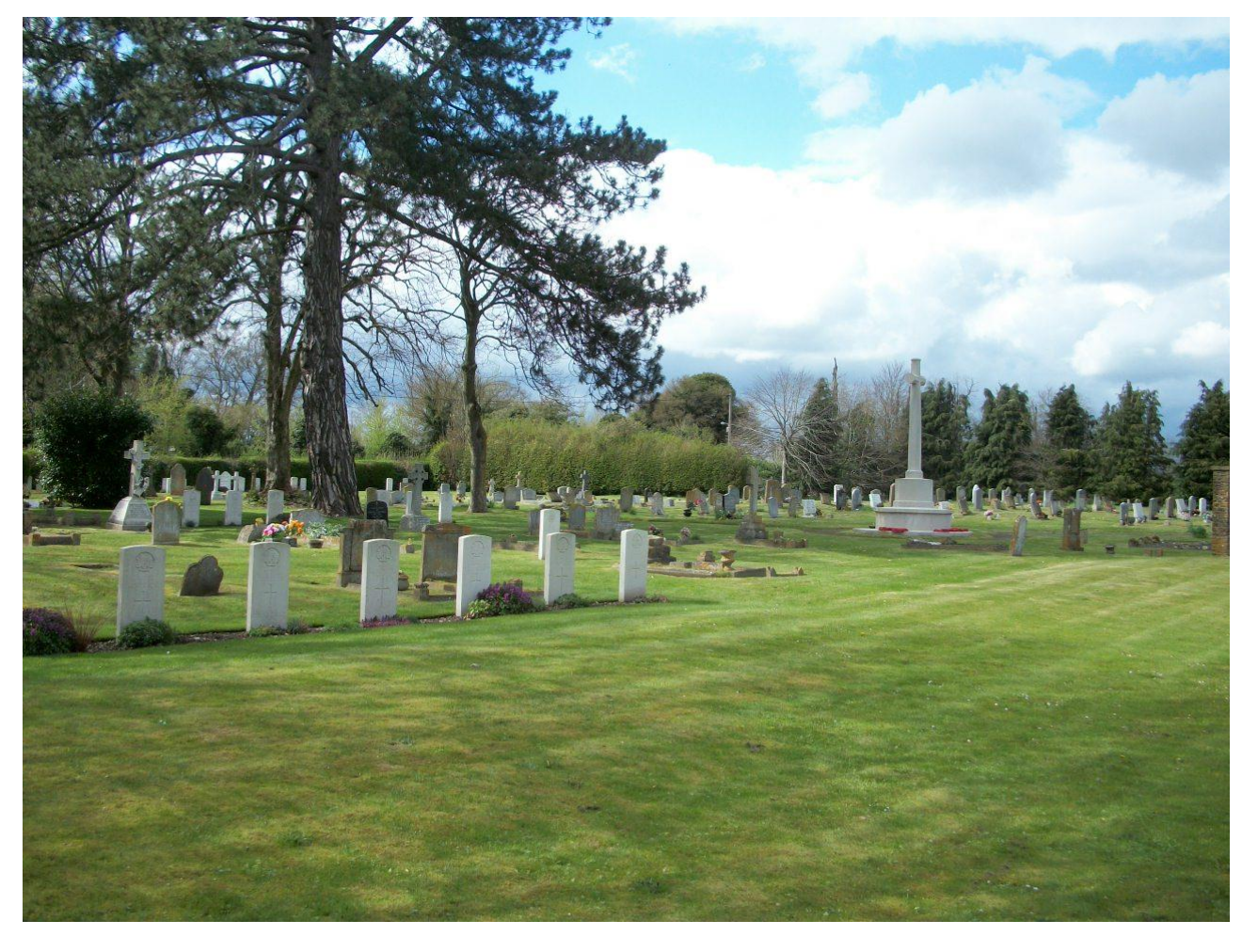
Bulford Church Cemetery