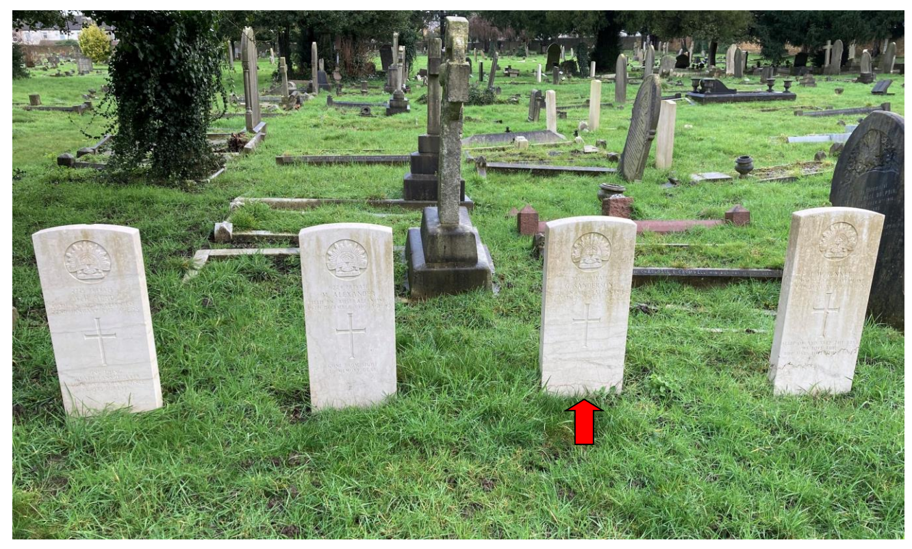
Four WW1 Australian War Graves – Read, Alexander, Sanderson & Bennett