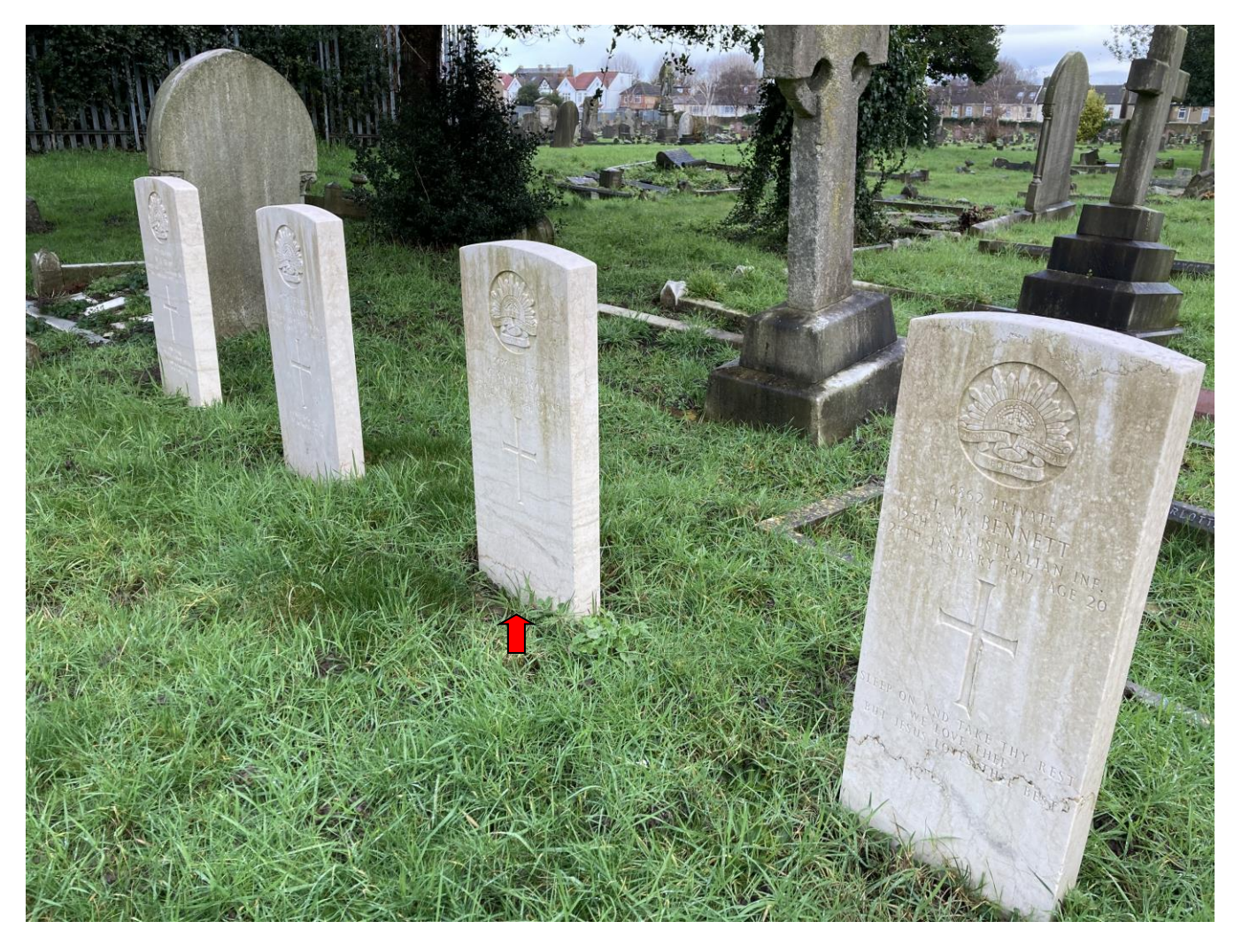
Four WW1 Australian War Graves – Read, Alexander, Sanderson & Bennett