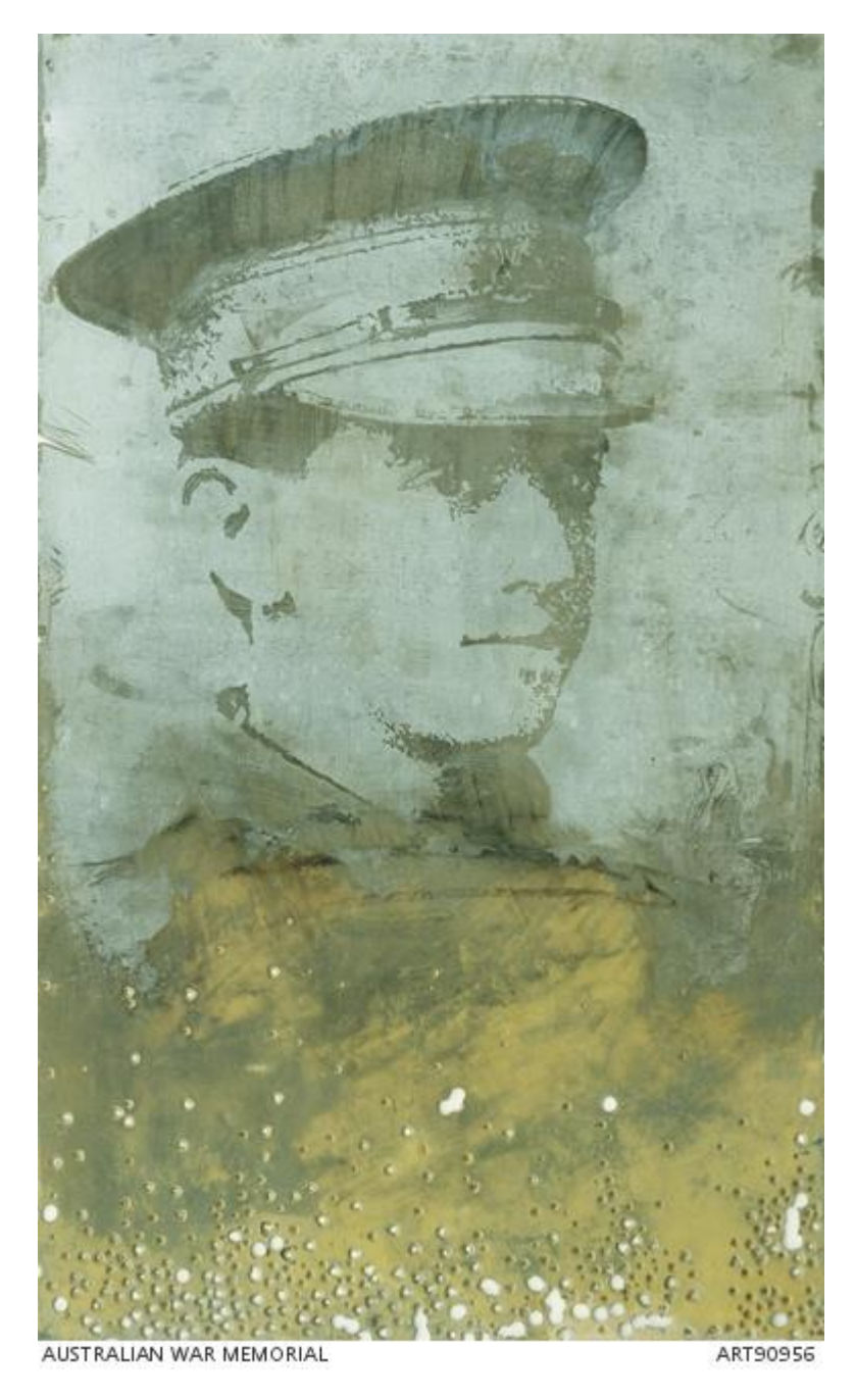
Private Reginald Clarence Scanes (Artwork by Murray Kirkland)