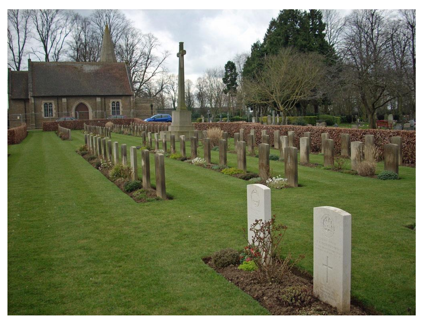
Towcester Road Cemetery, Northampton