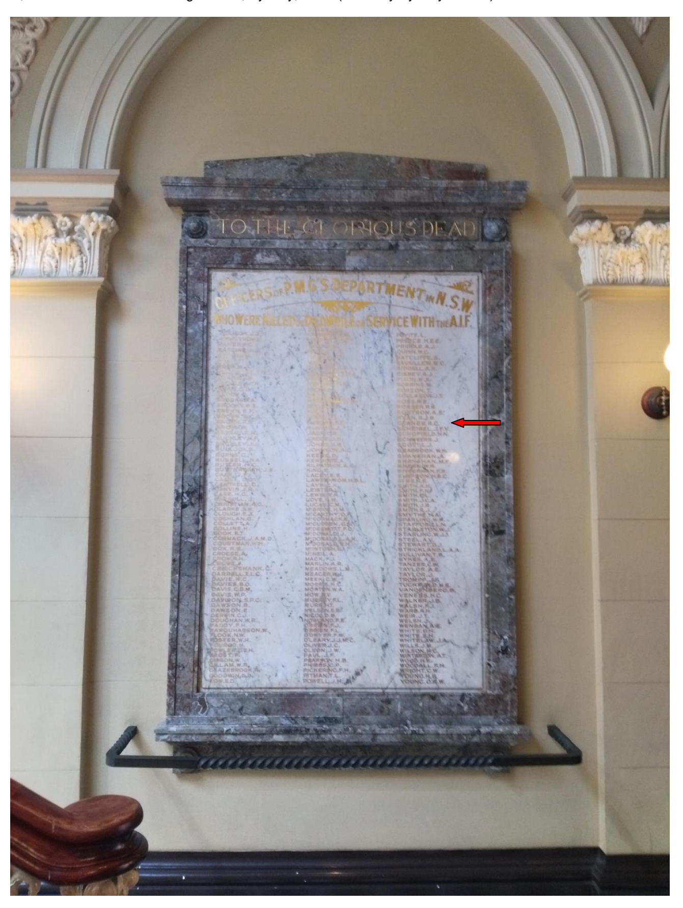
Postmaster General's Department in NSW Honour Roll