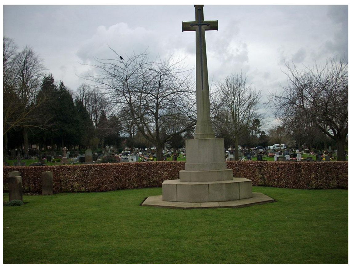
Towcester Road Cemetery, Northampton

Northampton (Towcester Road) Cemetery contains 116 First World War burials and 17 from the Second World War, most of which form a combined war graves plot to the left of the chapel. The cemetery also contains five non-war service burials and three Czech war graves. (Information & photos from CWGC)