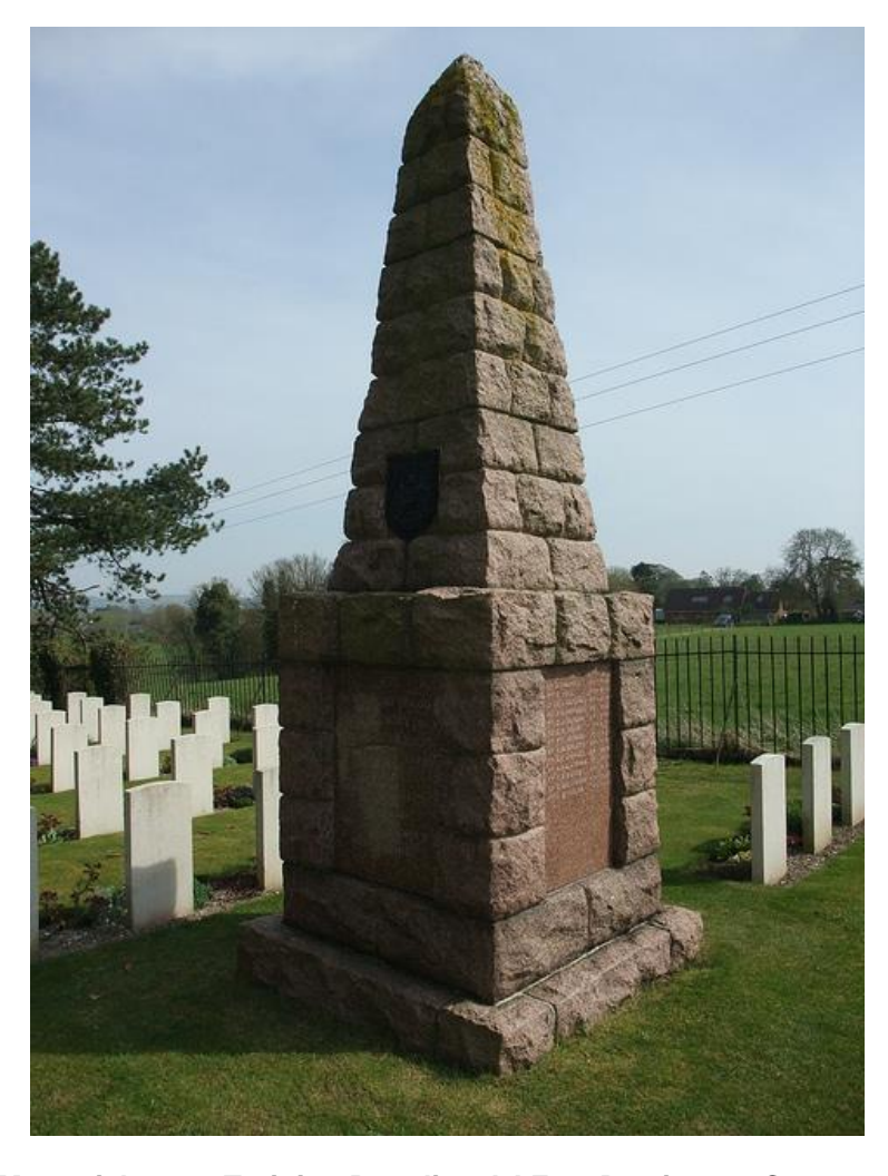
Memorial to 1st Training Battalion A.I.F. at Durrington Cemetery