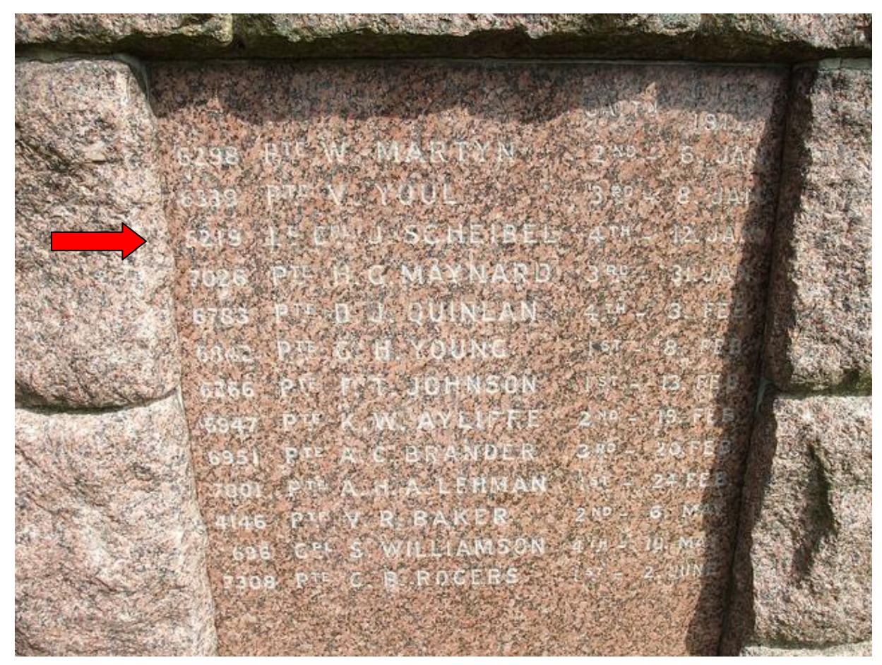
Memorial to 1st Training Battalion A.I.F. at Durrington Cemetery