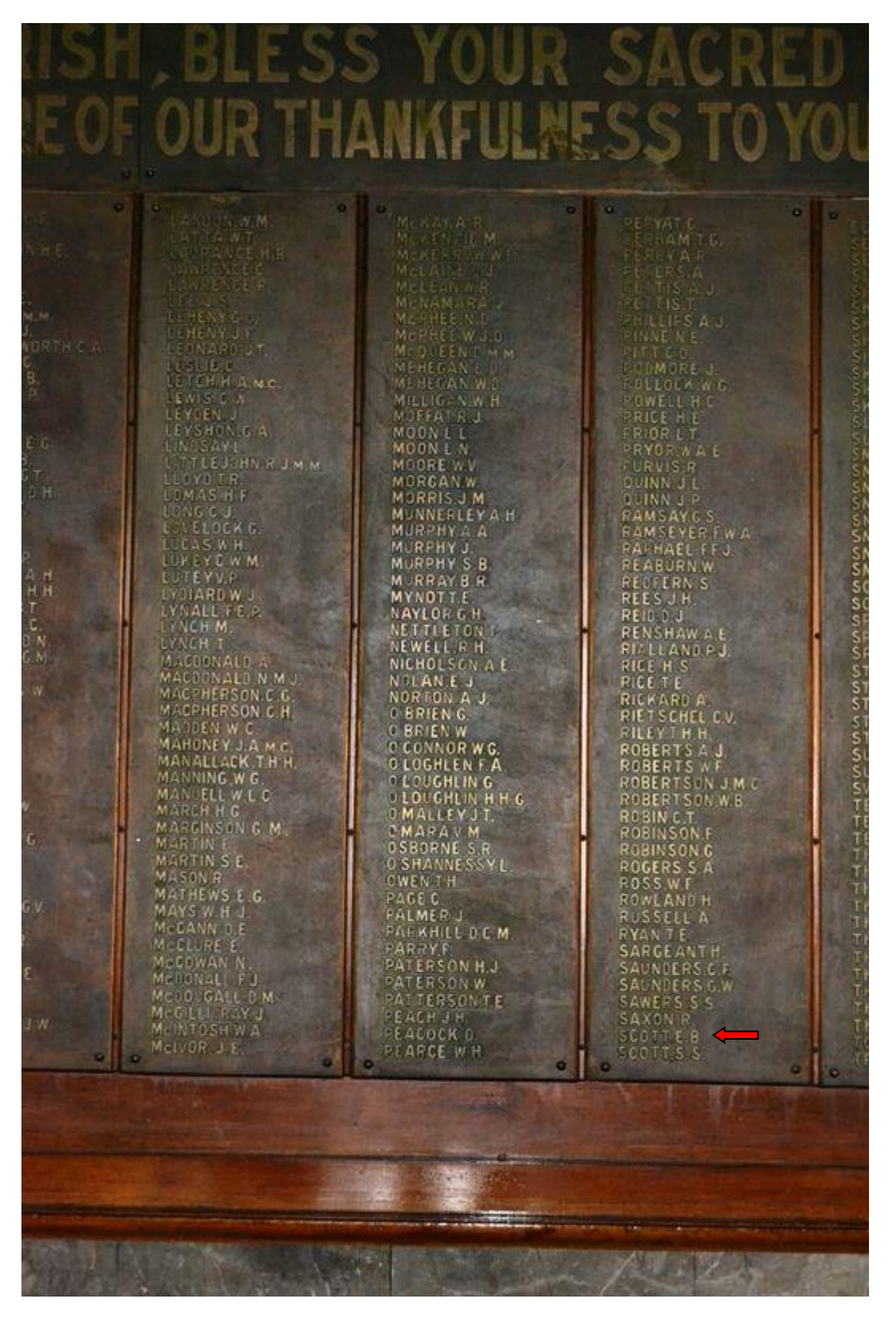
Brunswick Town Hall Honour Roll

(78 pages of Private Ernest Bolney Scott's Service records are available for On Line viewing at National Archives of Australia website).