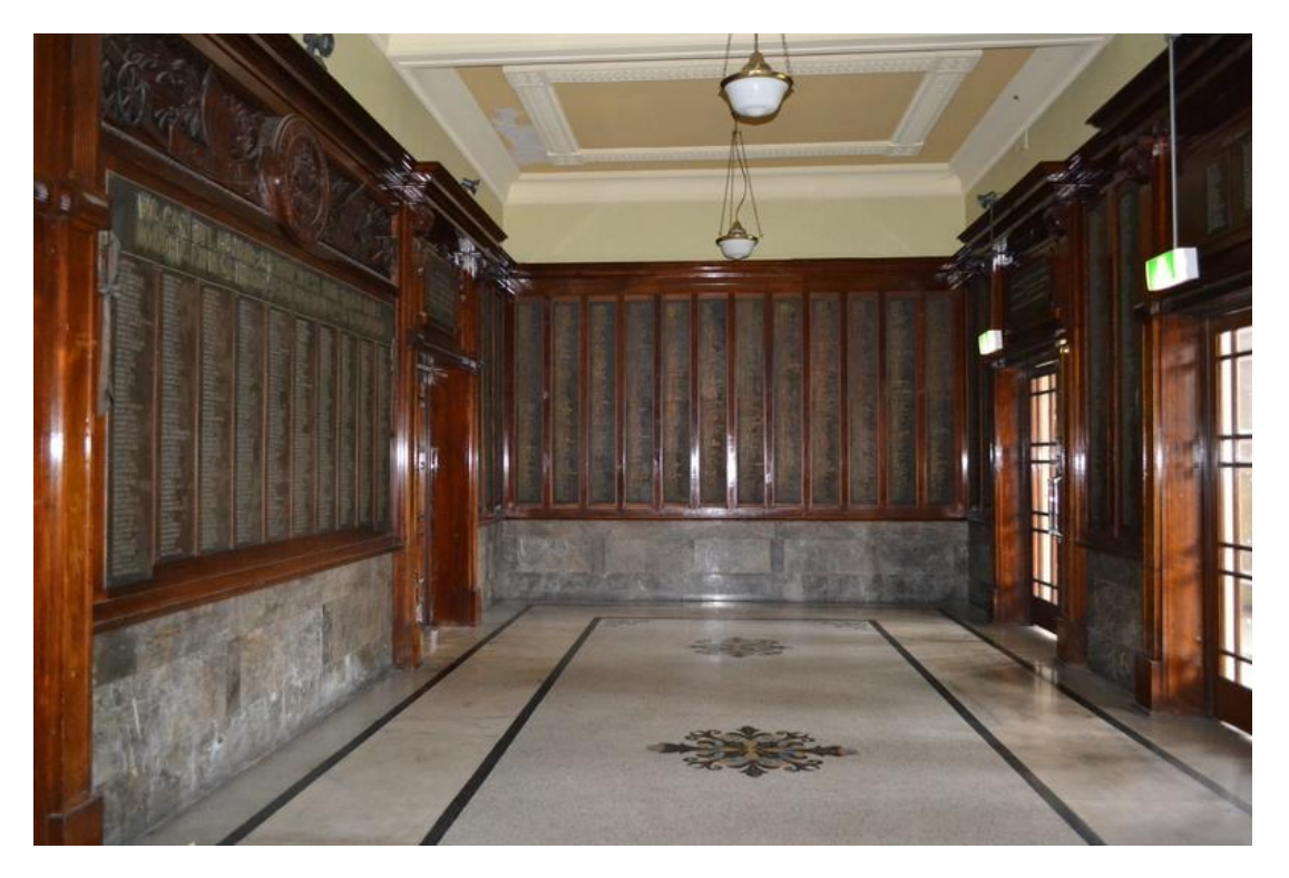
Brunswick Town Hall Honour Roll

E. B Scott is remembered on the Brunswick Town Hall Honour Roll, located in Foyer, Brunswick Town Hall, 233 Sydney Road, Brunswick, Victoria.