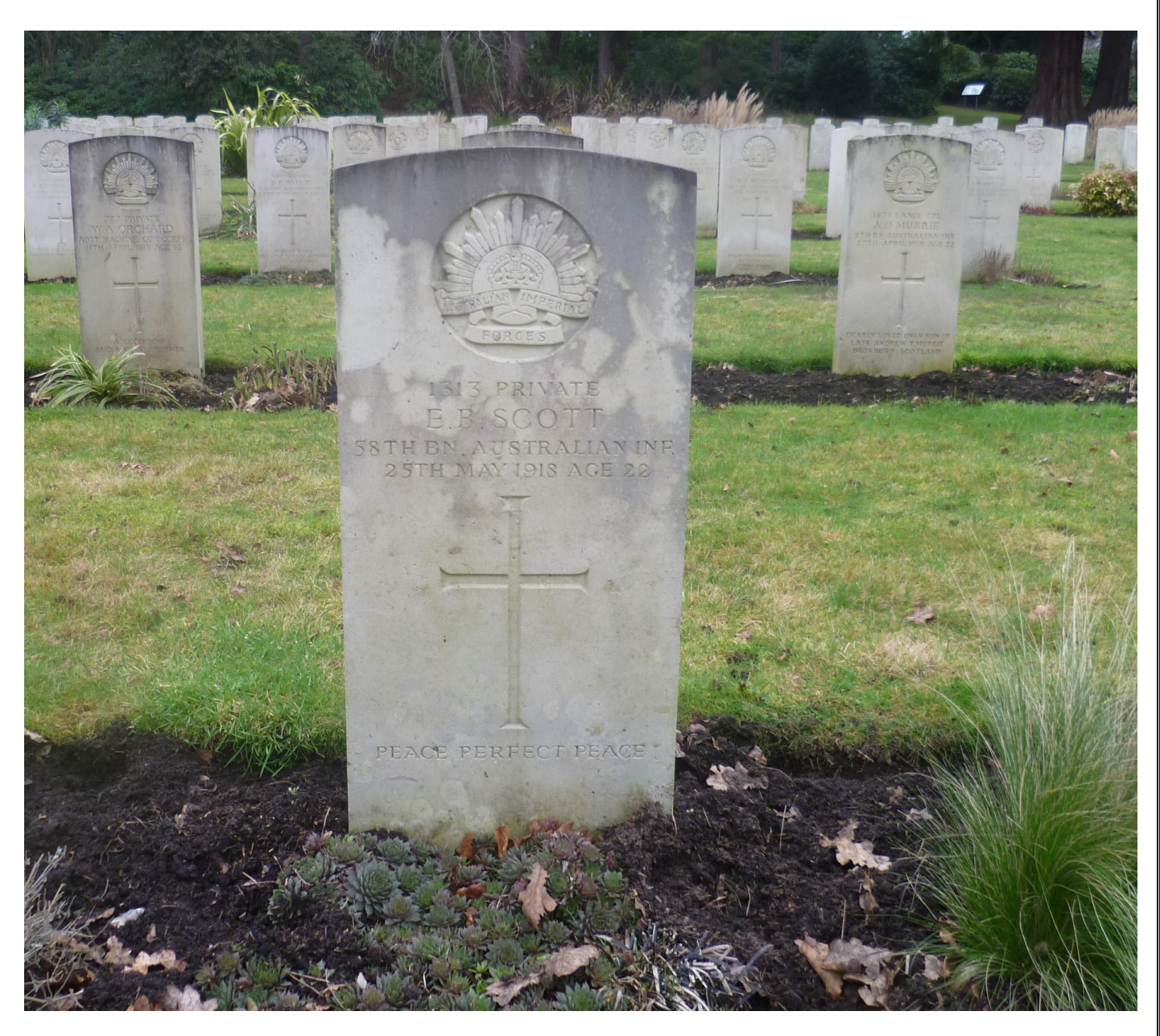
Photo of Private E. B. Scott's Commonwealth War Graves Commission Headstone in Brookwood Military Cemetery, Surrey, England.