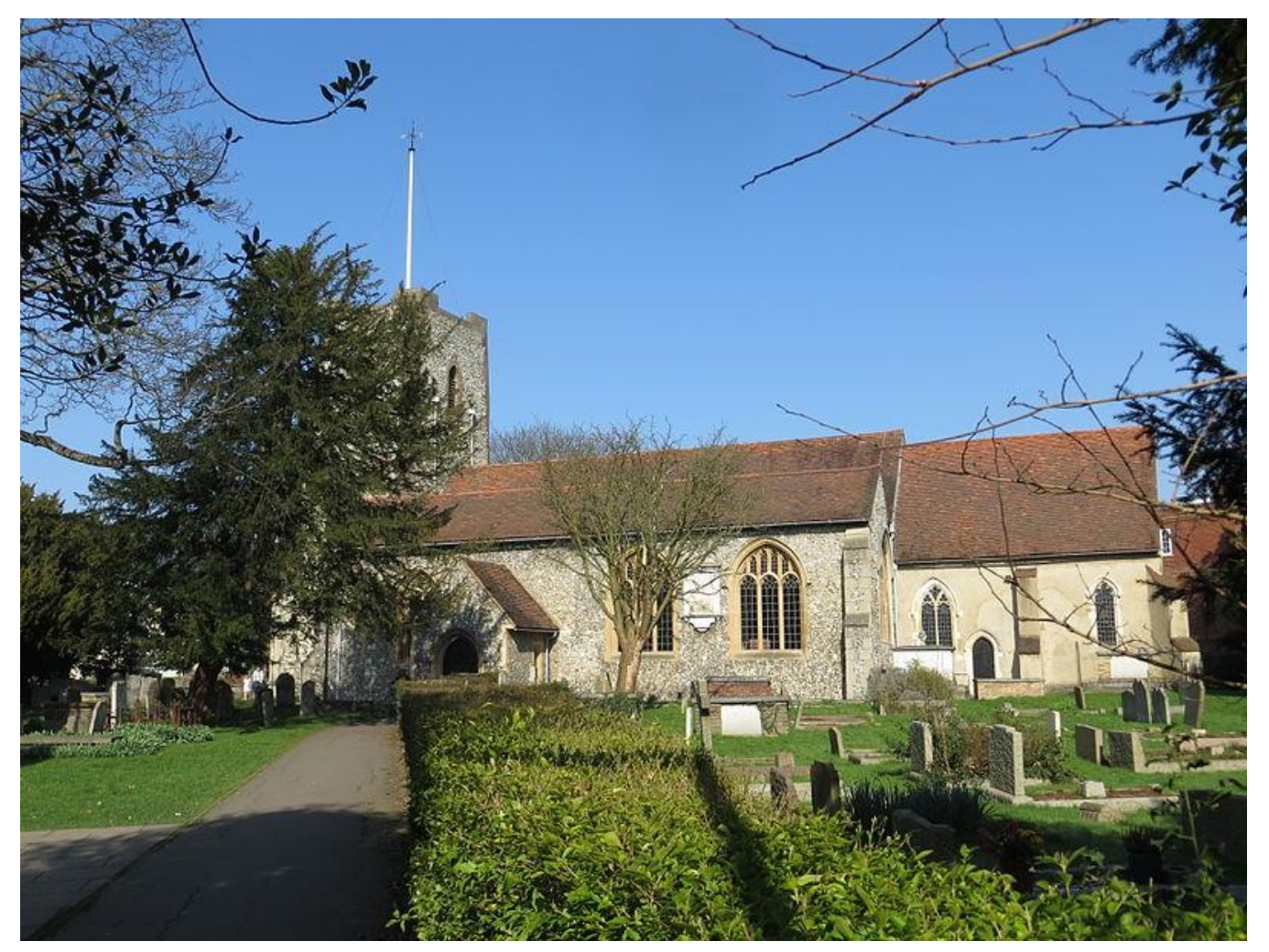
St. Mary's Churchyard Walton-On-Thames

The commemoration of the casualties is on Screen Wall monuments rather than individual headstones as some graves contain more than one burial. Two plots containing eight grave spaces are directly in front of the two Screen Walls and the other plots are elsewhere in the graveyard.