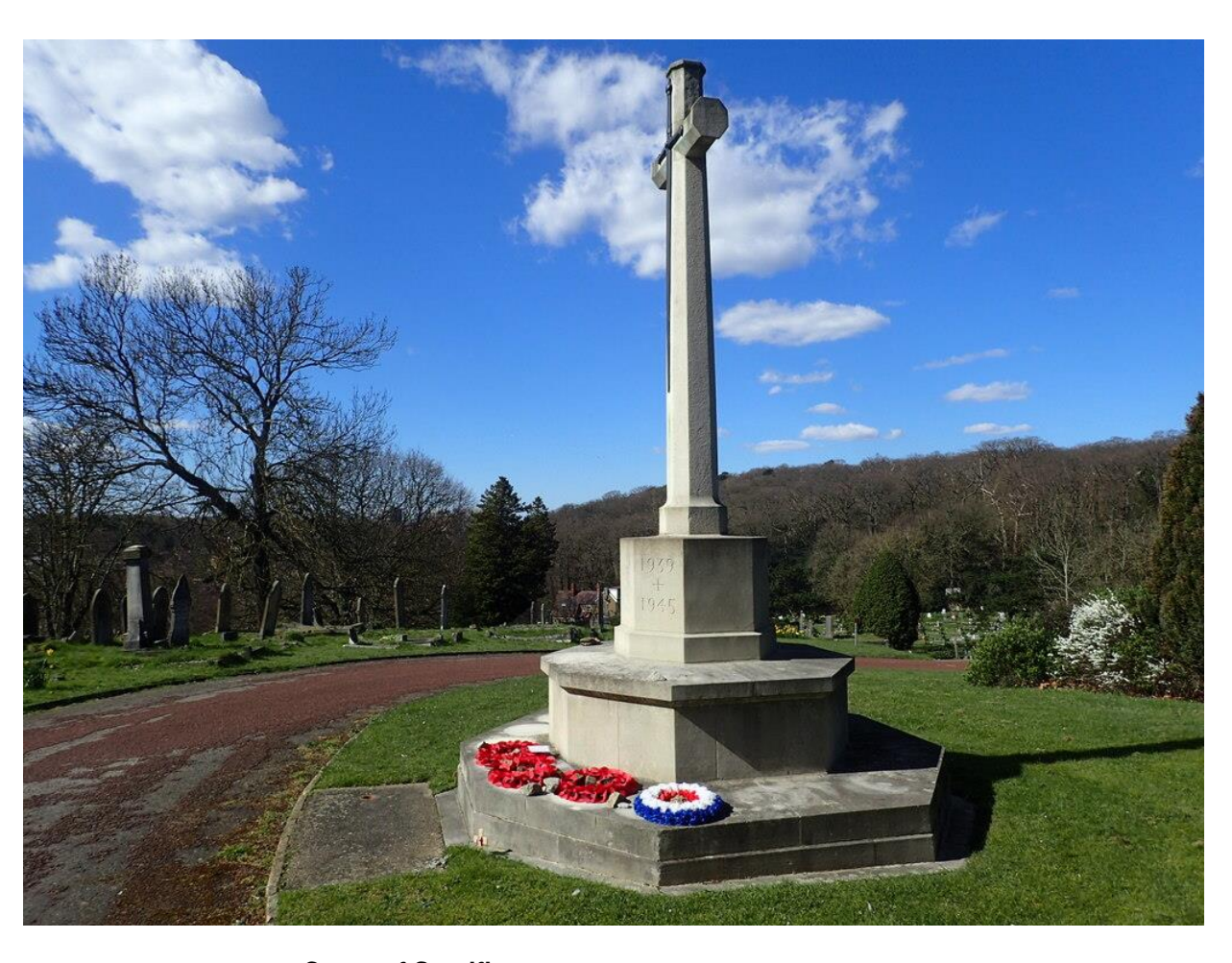
Cross of Sacrifice