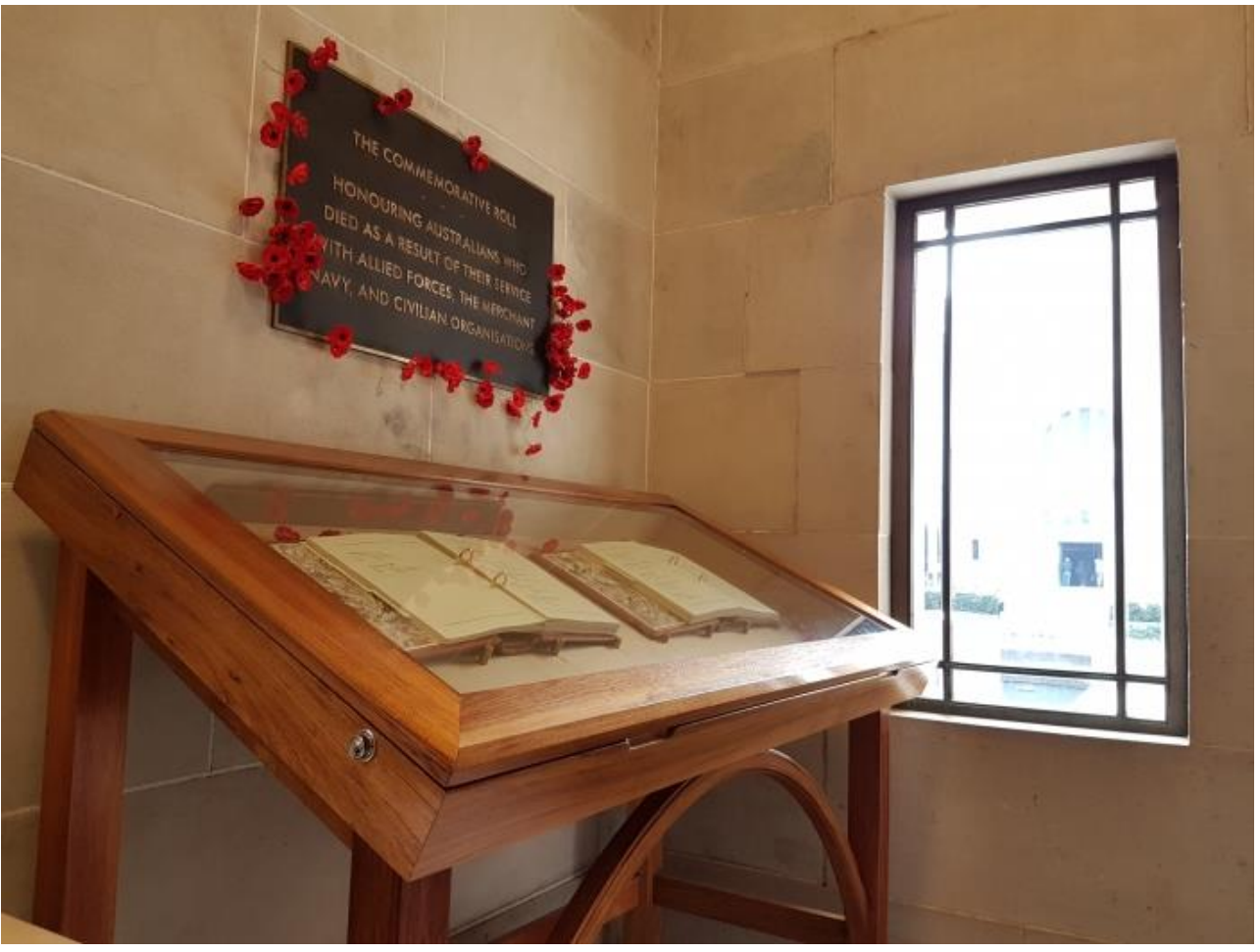
Commemorative Roll