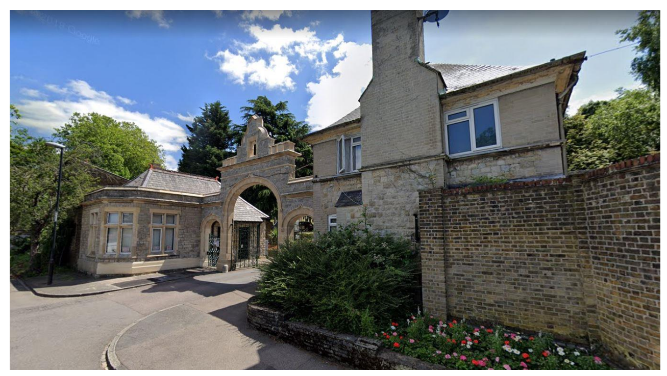
Plumstead Cemetery Entrance

Plumstead Cemetery contains 187 Commonwealth War Graves – 106 relating to World War 1 & 81 relating to World War 2.