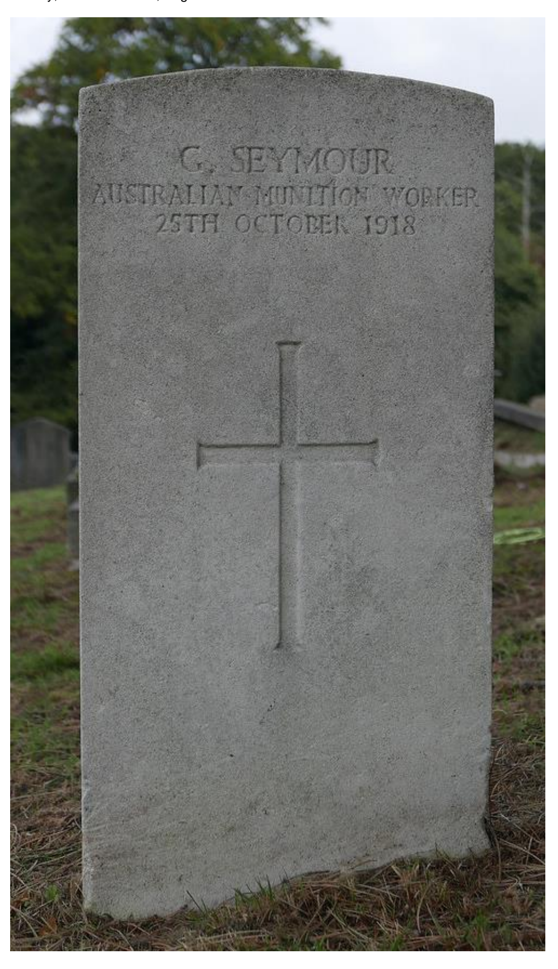
Photo of Australian Munition Worker G. Seymour's Commonwealth War Graves Commission Headstone in Plumstead Cemetery, Greater London, England.