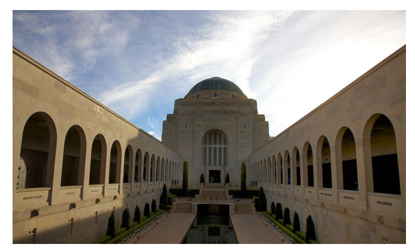
Commemorative Area of the Australian War Memorial