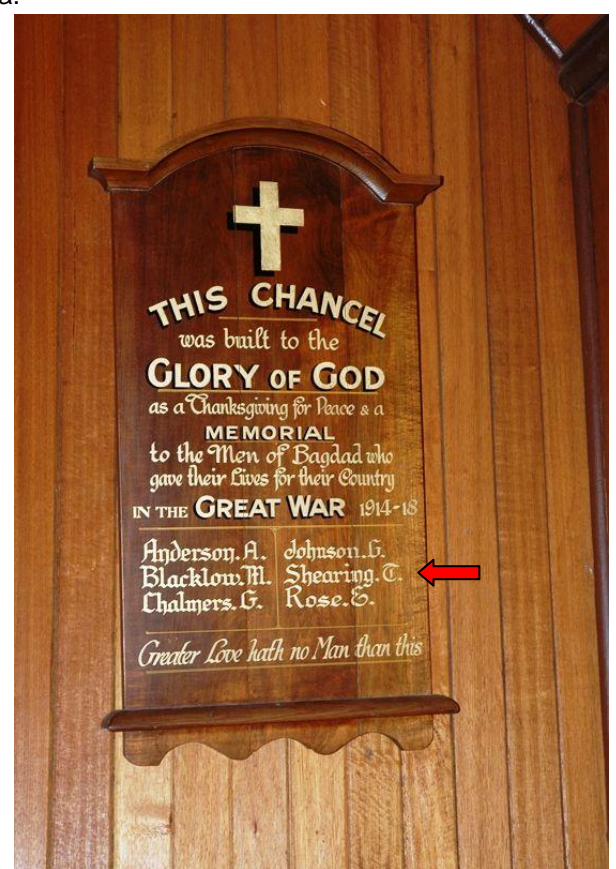
Bagdad Anglican Church Chancel Plaque

T. Shearing is remembered on the Bagdad Anglican Church Chancel Plaque located in Bagdad Anglican Church, 40 School Road, Bagdad, Tasmania.