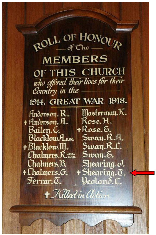
Bagdad Anglican Church Roll of Honour

T. Shearing is remembered on the Bagdad Anglican Church Roll of Honour located in Bagdad Anglican Church, 40 School Road, Bagdad, Tasmania.