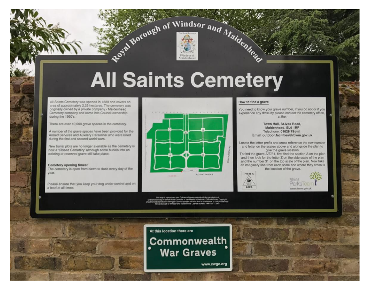
All Saints Cemetery, Maidenhead

All Saints Cemetery, Maidenhead, Berkshire, England contains 61 Commonwealth War Graves. There are 14 graves from World War 1 & 47 from World War 2. There is only 1 Australian Forces burial – Private Norman Edwin Sheldon.