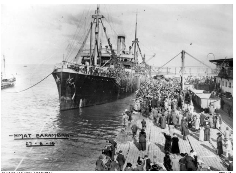
HMAT Barambah (A37)

Private Walter Samuel Short was one of eighteen deaths on board HMAT Barambah (A37) on the voyage from Australia to England.