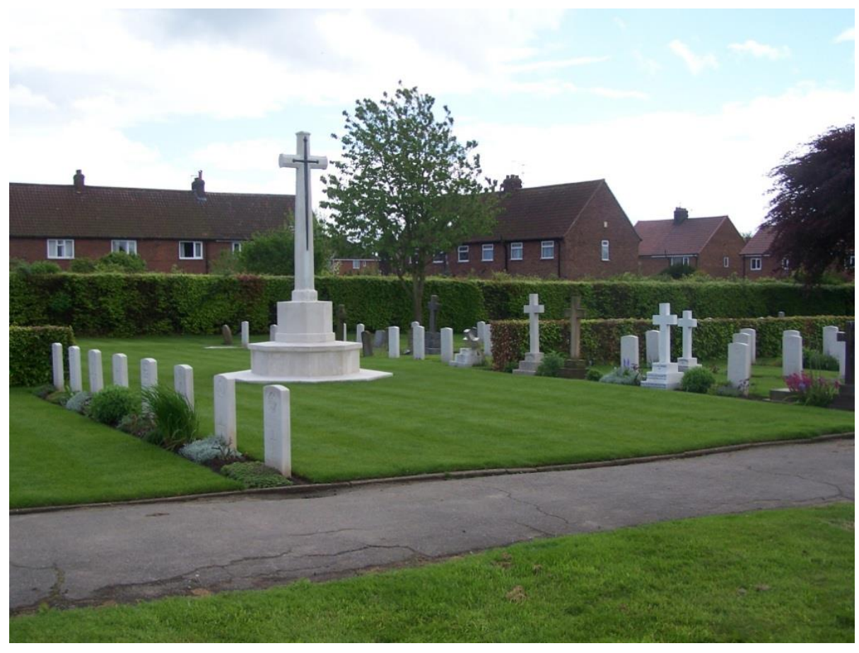
Cross of Sacrifice in Fulford Cemetery

Fulford Cemetery contains 235 Commonwealth Commission War Graves – 106 from World War 1 & 129 from World War 2.