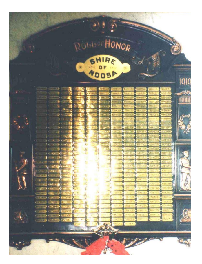
Shire of Noosa Roll of Honour