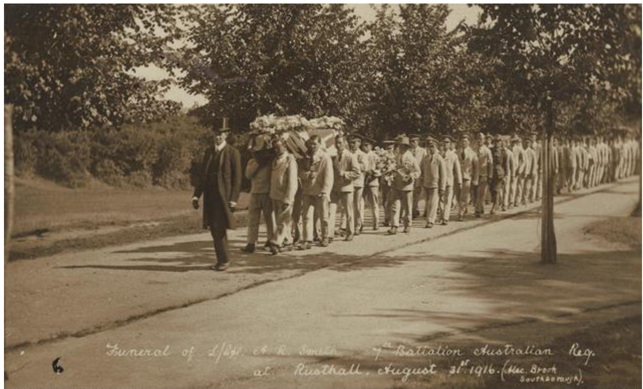
AUSTRALIAN WAR MEMORIAL P12499.00