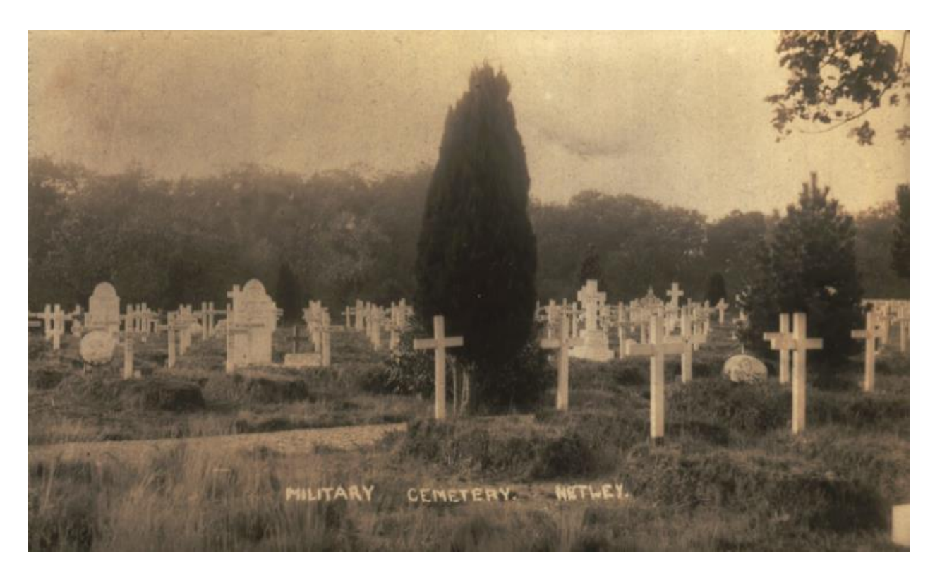
Original Cross markers – Netley Military Cemetery