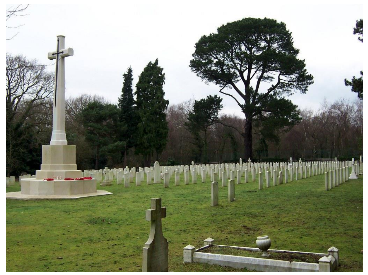
Netley Military Cemetery, Hampshire