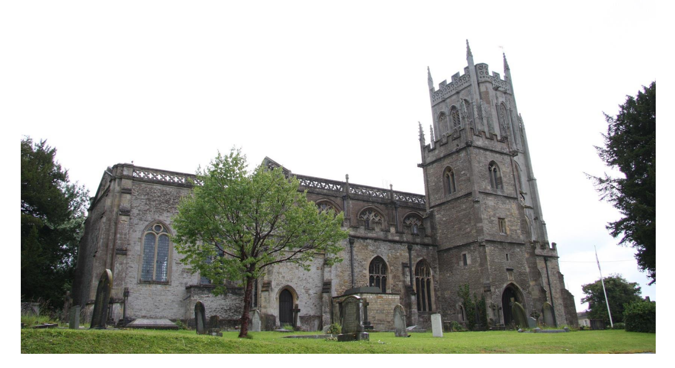
St. Mary's Church & Churchyard

St. Mary's Churchyard, Bruton contains 4 Commonwealth War Graves – 2 from World War 1 & 2 from World War 2.