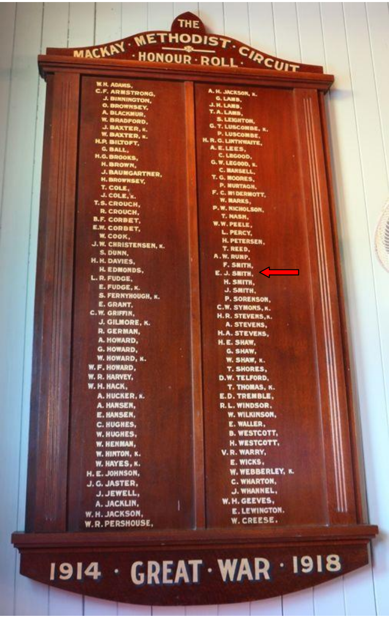
Mackay Methodist Circuit Honour Roll