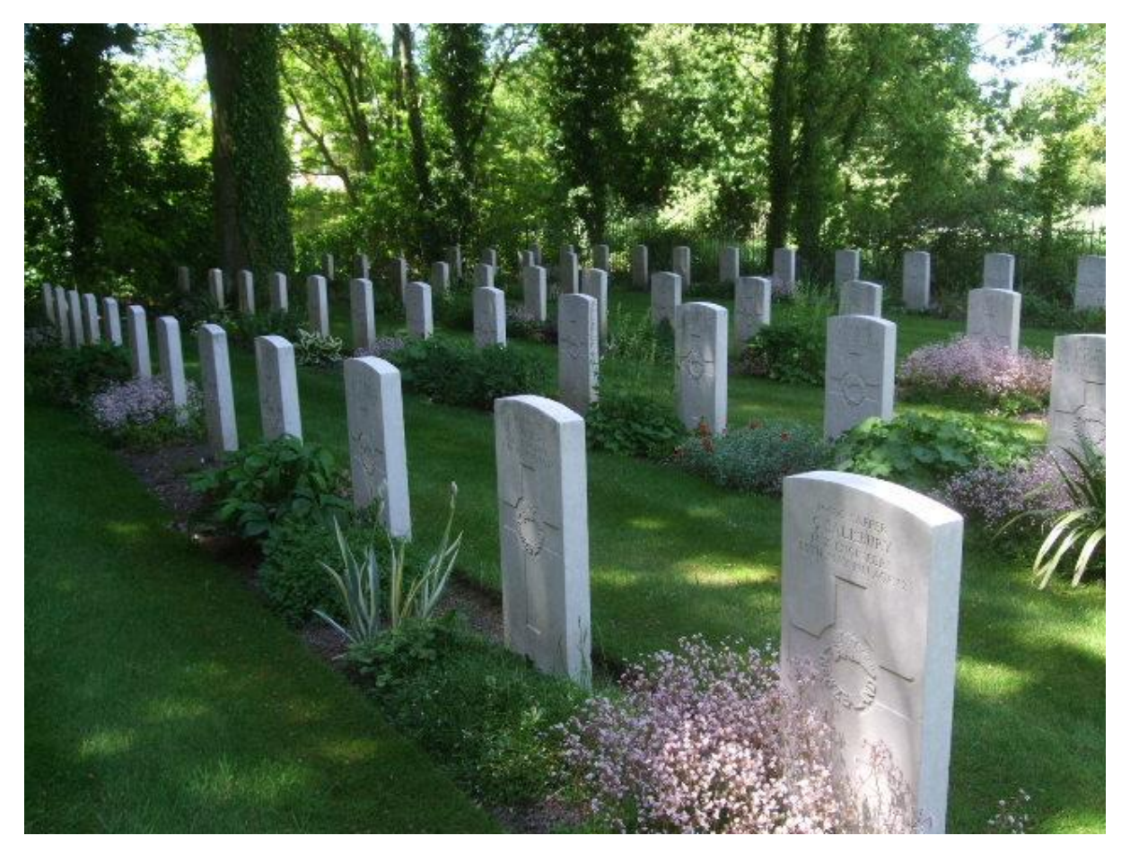
New Zealand Section of Codford Anzac War Graves Cemetery