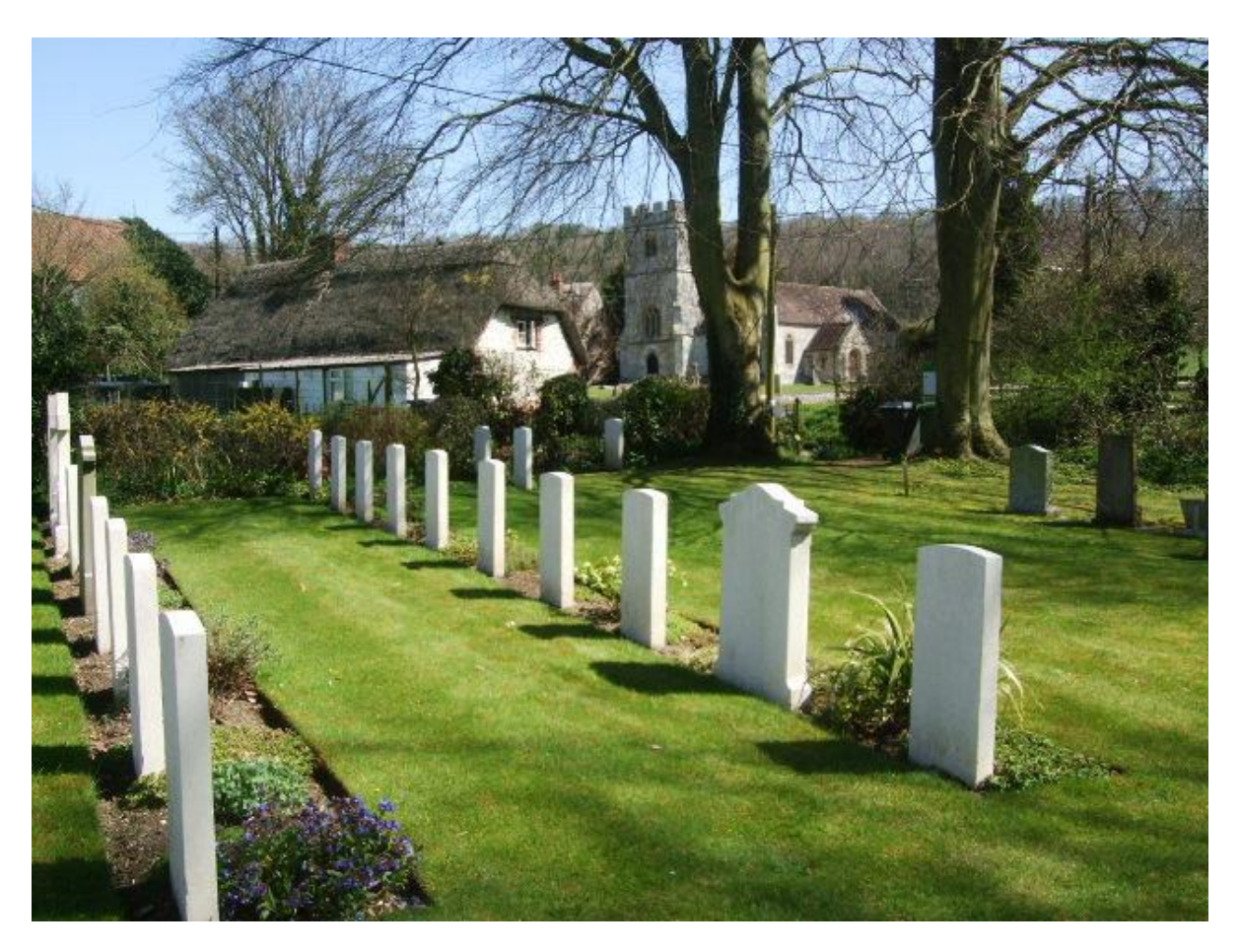
St. Mary's New Churchyard, Codford