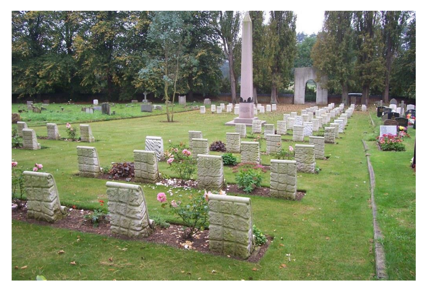
St. Mary the Virgin Churchyard, Harefield