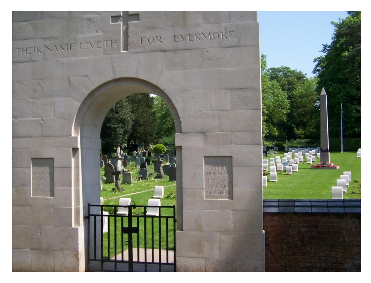
St. Mary the Virgin Churchyard, Harefield