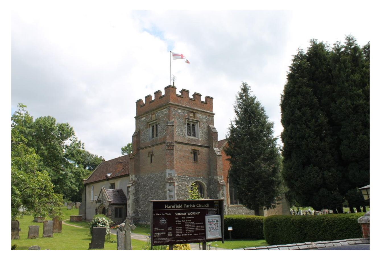
St Mary the Virgin Church, Harefield