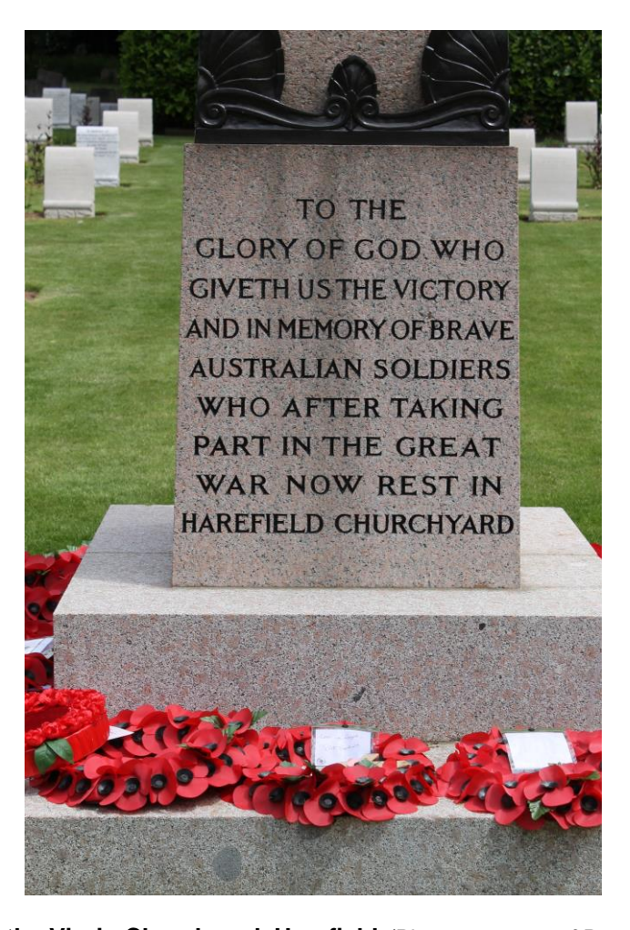
St. Mary the Virgin Churchyard, Harefield