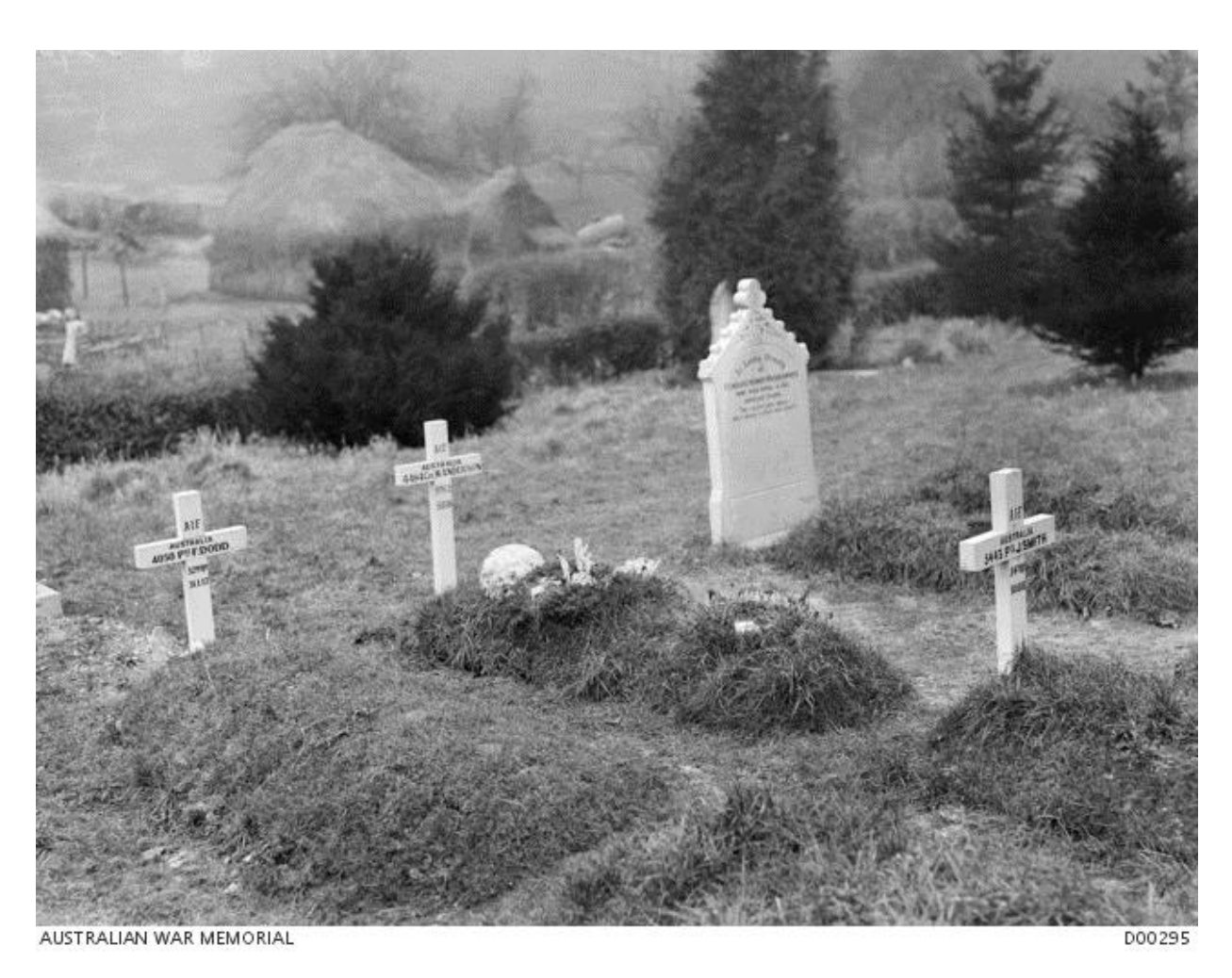
Original Grave Markers – Barford St. Martin Church Cemetery

Graves of Australian soldiers in the cemetery at Barford St. Martin's.