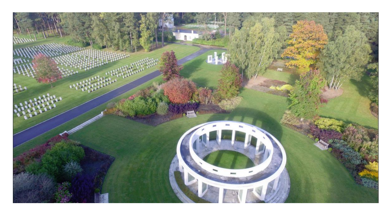
Brookwood Military Cemetery