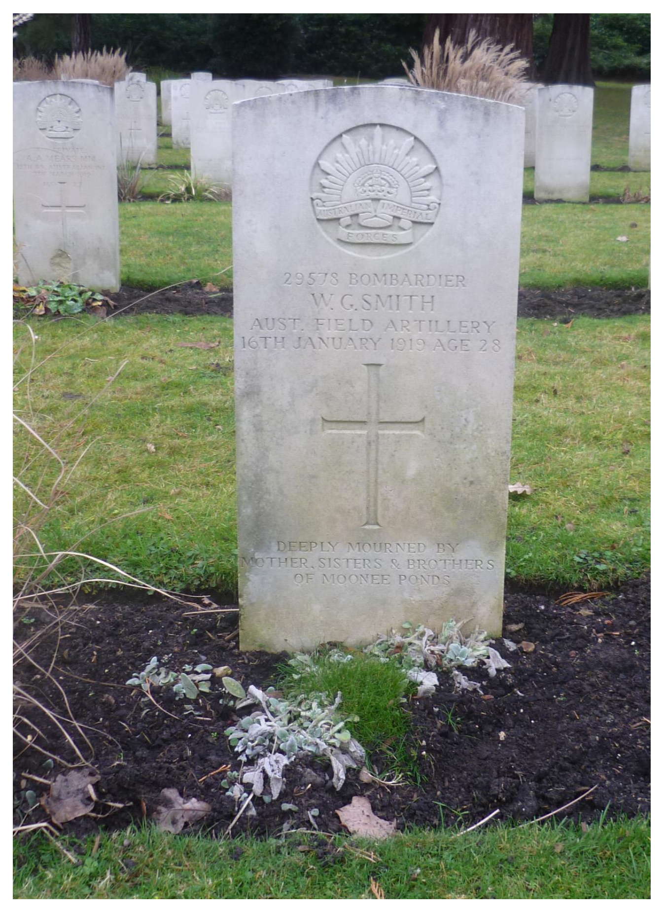
Photo of Bombardier W. G. Smith's Commonwealth War Graves Commission Headstone in Brookwood Military Cemetery, Surrey, England.