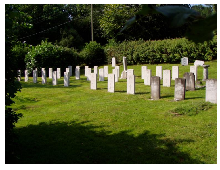
Compton Chamberlayne War Graves