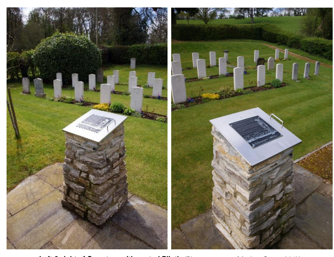
Left & right of Cemetery with central Plinth