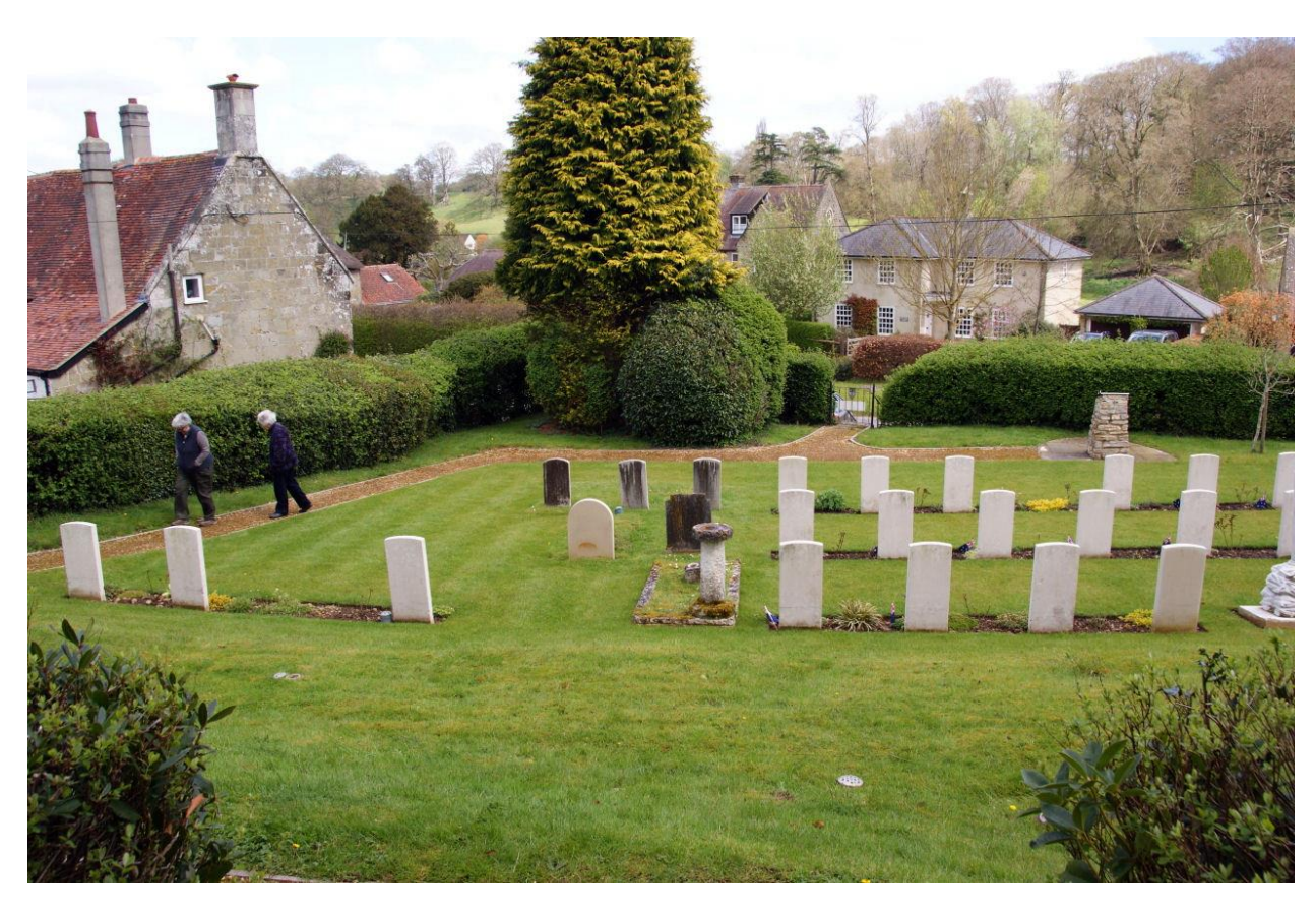
Photo taken from back of Cemetery looking towards the Entrance