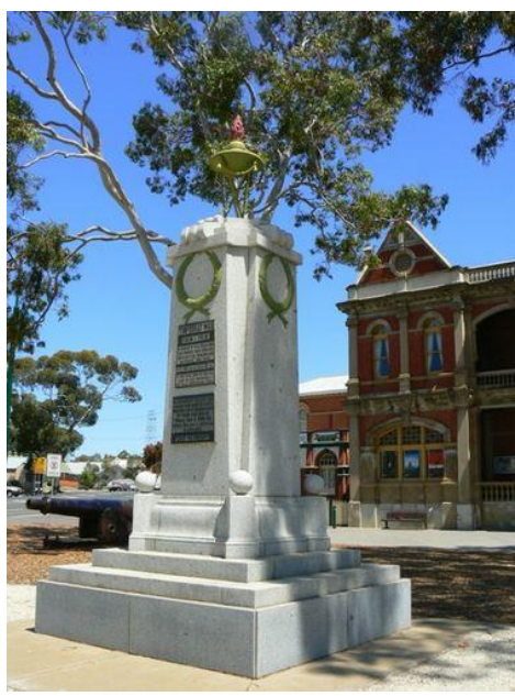
Eaglehawk War Memorial

The Eaglehawk War Memorial, located outside the Town Hall, Teg Leg & Sailors Gully Roads, Eaglehawk, Victoria does not list individual names.