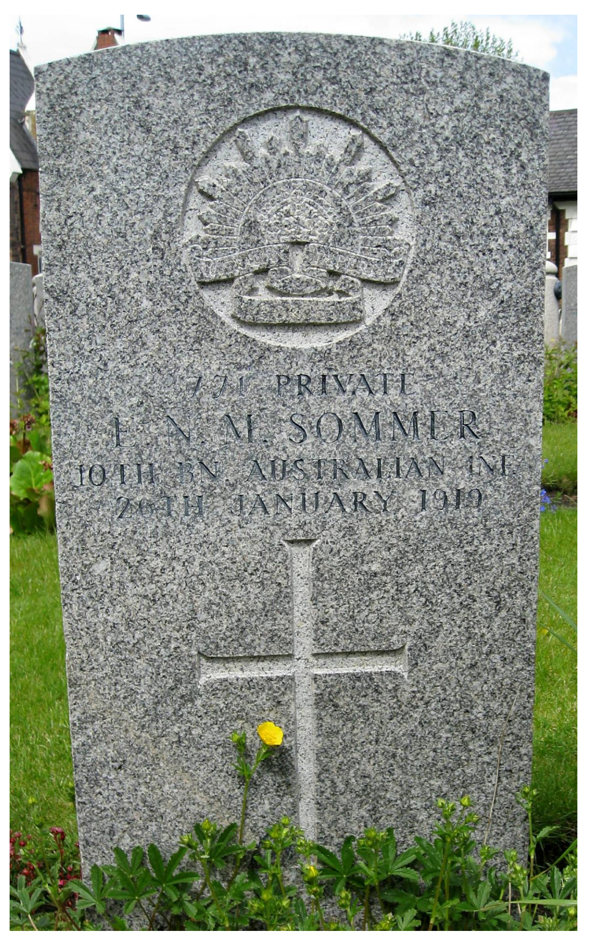
Photo of Private E. N. M. Sommer's Commonwealth War Graves Commission Headstone in Warrington Cemetery, Warrington, Cheshire/Lancashire, England.