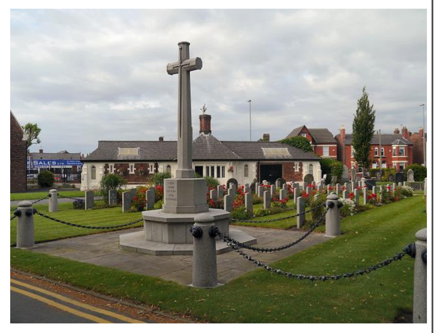
Cross of Sacrifice & War Graves in Warrington Cemetery