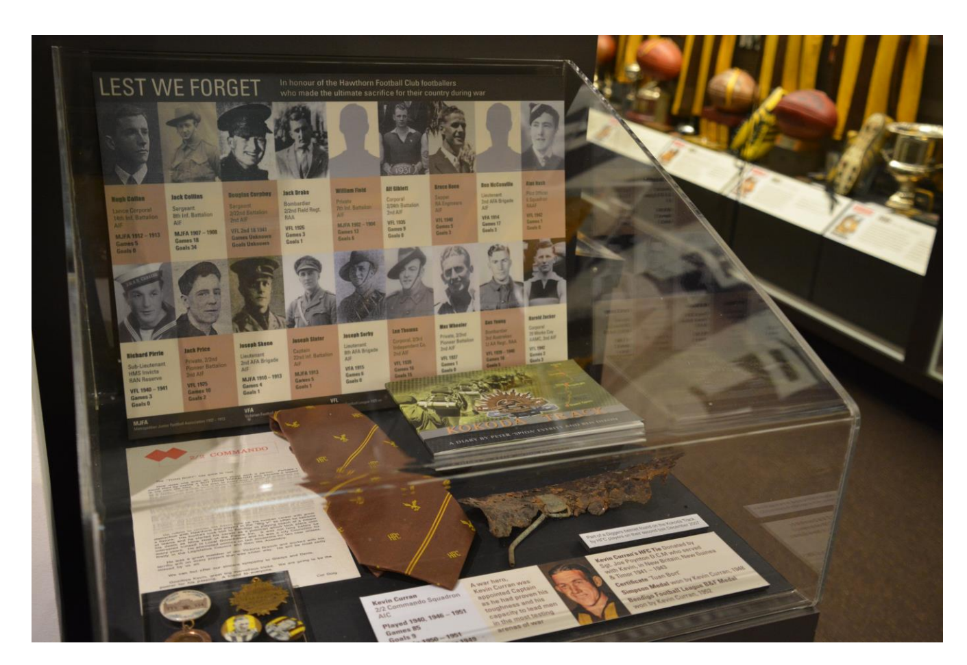
Hawthorn War Service Cabinet