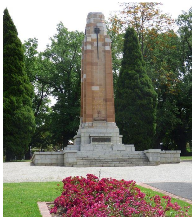
The Hawthorn Cenotaph ((Photo from Monument Australia)

The Hawthorn Cenotaph, located in St. James Park, Burwood Road, Hawthorn, Victoria, does not list individual names.