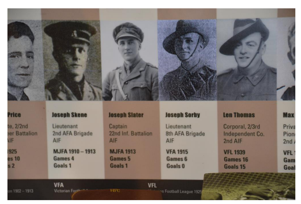
Hawthorn War Service Cabinet

(85 pages of Lieutenant Joseph Austin Sorby's Service records are available for On Line viewing at National Archives of Australia website).