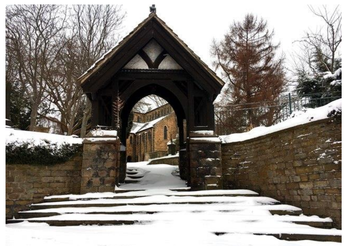
Lych Gate at All Saints Church, Ecclesall

All Saints Churchyard, Ecclesall contains 32 Commonwealth War Graves – 14 from World War 1 & 18 from World War 2.