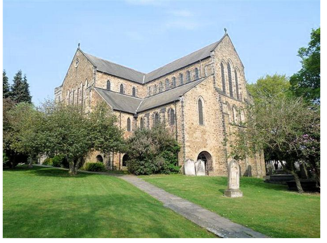
All Saints Church, Ecclesall