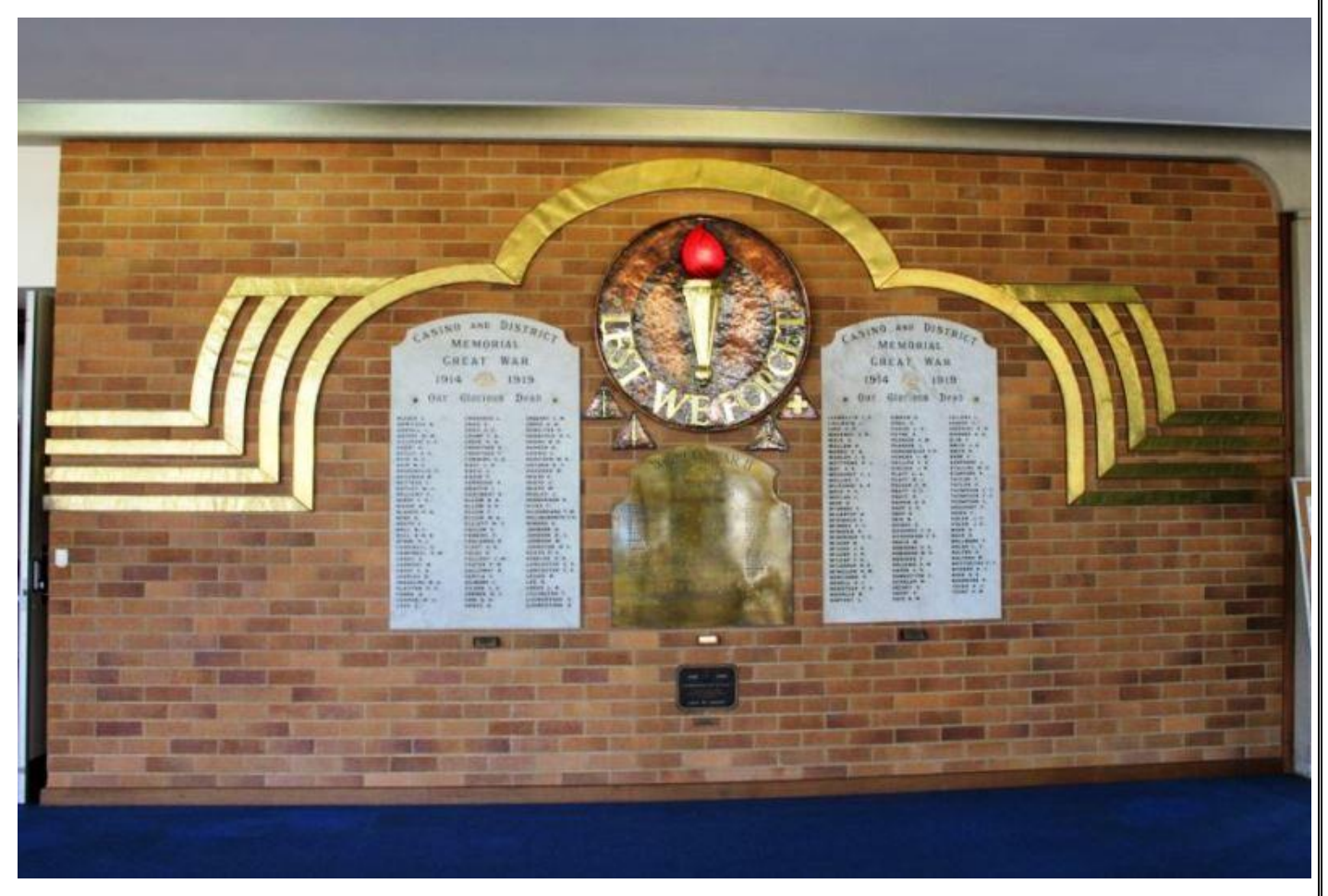
Casino and District Memorial