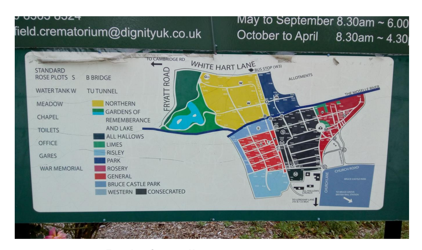
Tottenham Cemetery Map