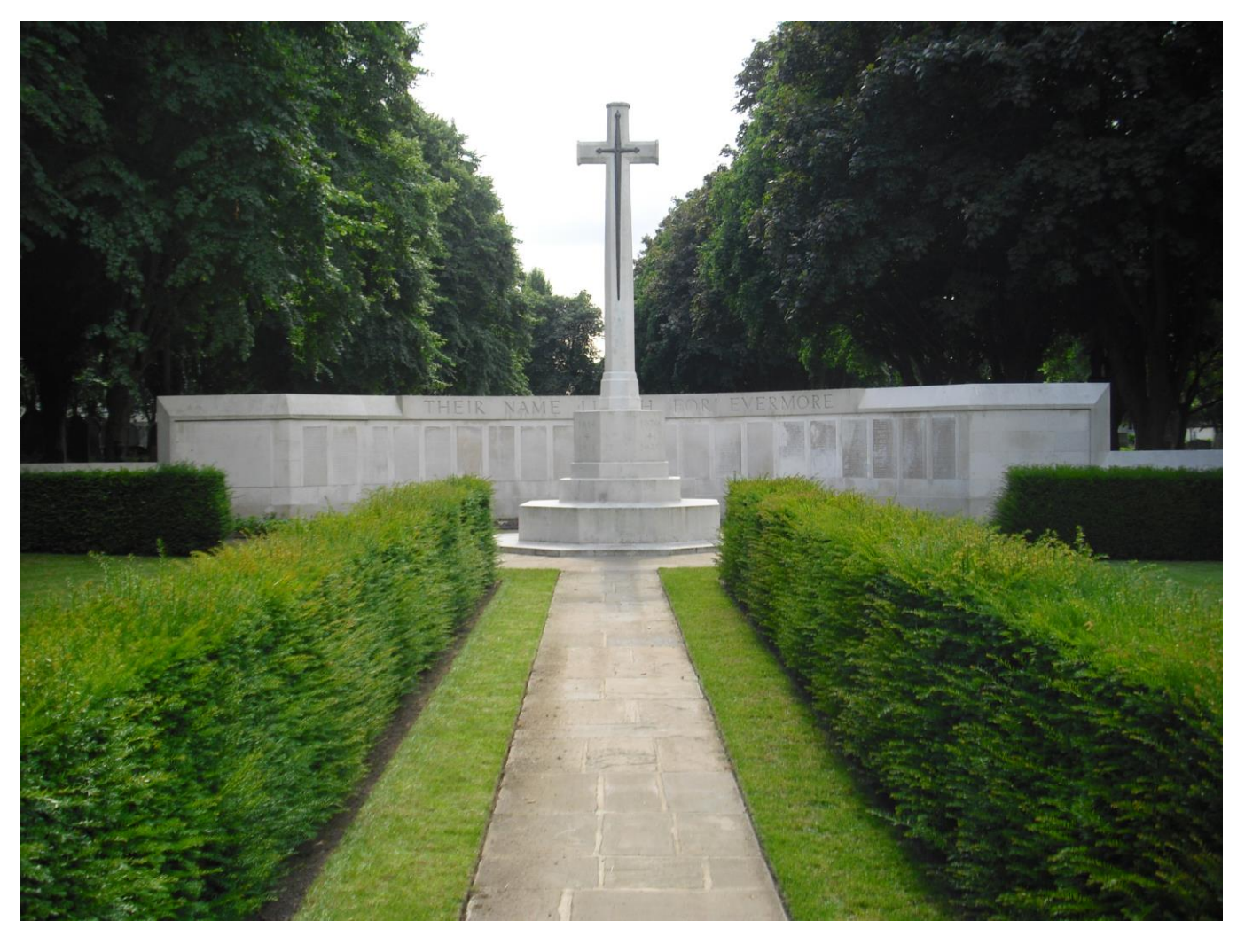
Tottenham Cemetery