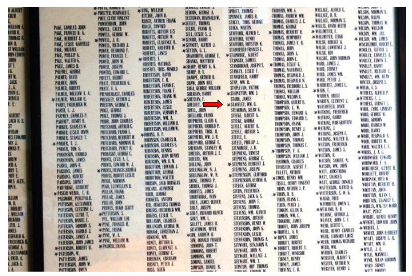
South Melbourne Roll of Honour

Private W. G. Staveley is commemorated on the Roll of Honour, located in the Hall of Memory Commemorative Area at the Australian War Memorial, Canberra, Australia on Panel 166.