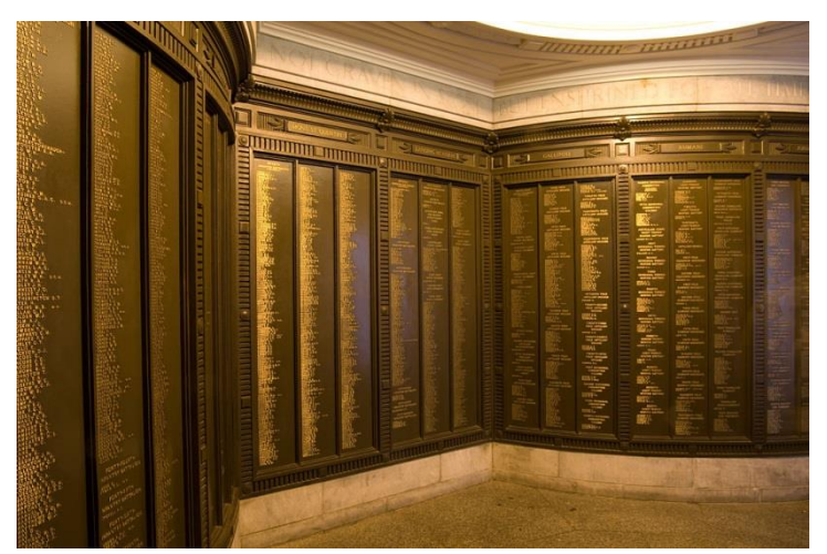
National War Memorial - Adelaide