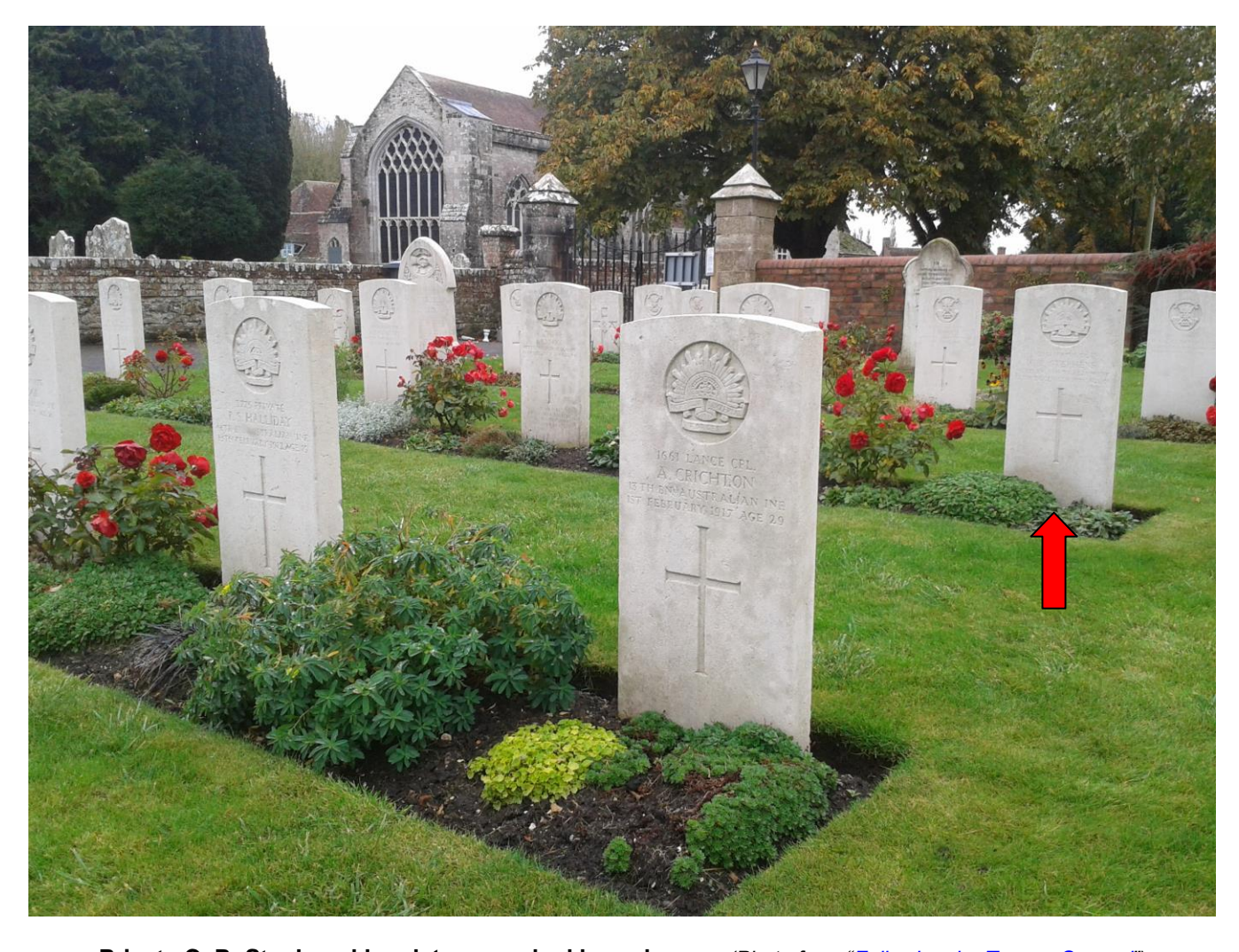
Private C. R. Stephens' headstone marked by red arrow