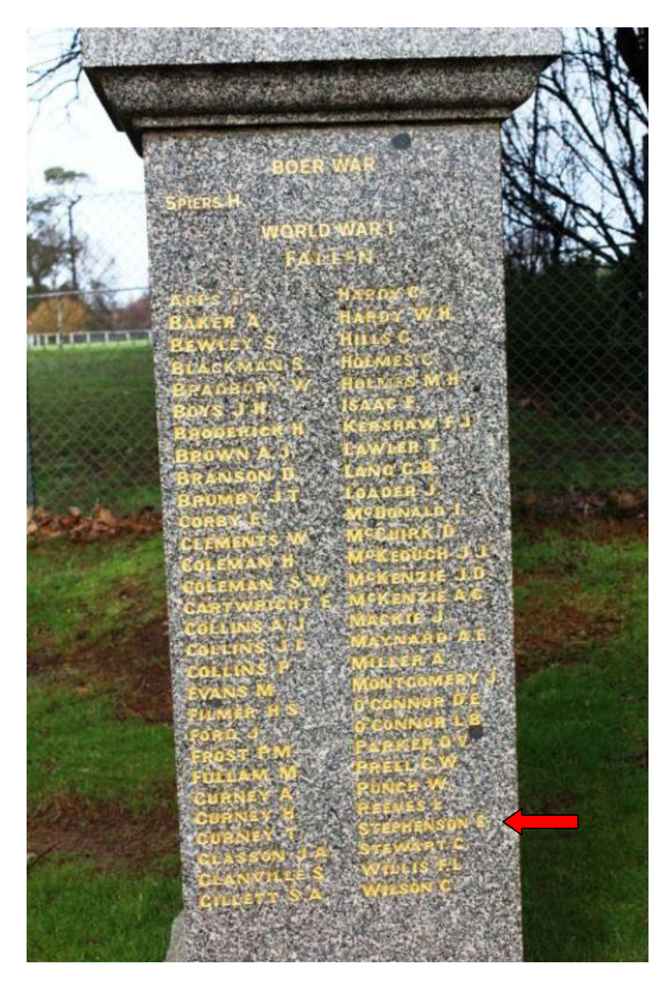
Crookwell War Memorial - Granite Columns