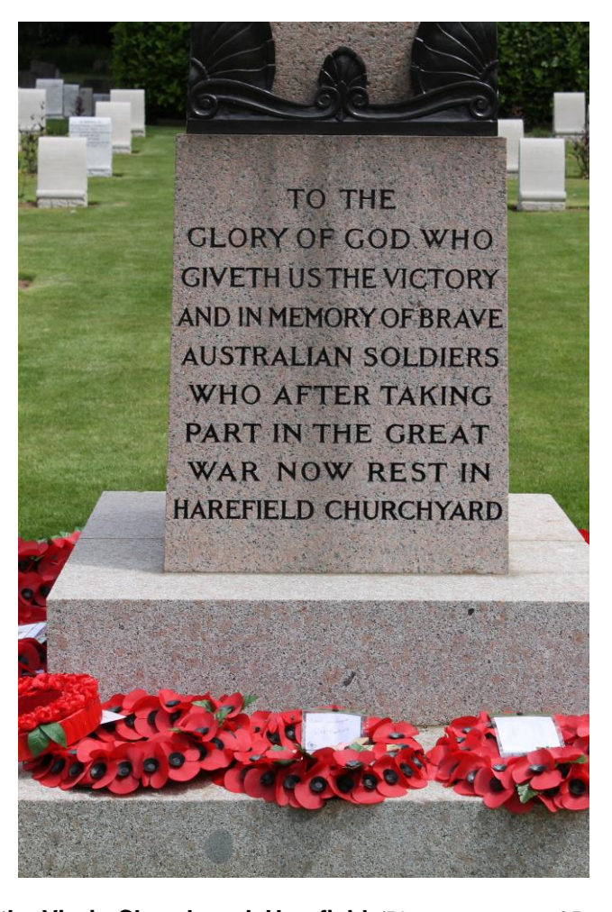
St. Mary the Virgin Churchyard, Harefield