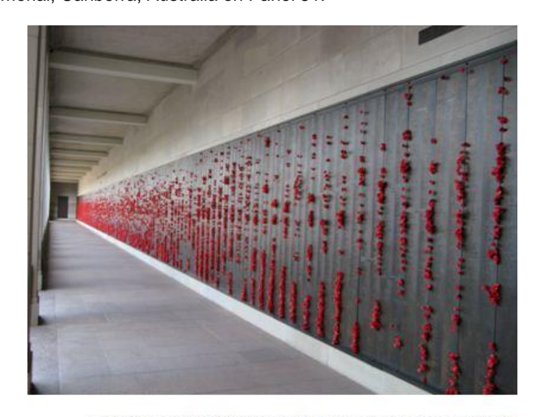
Roll Of Honour WW1 Australian War Memorial Canberra, Australia