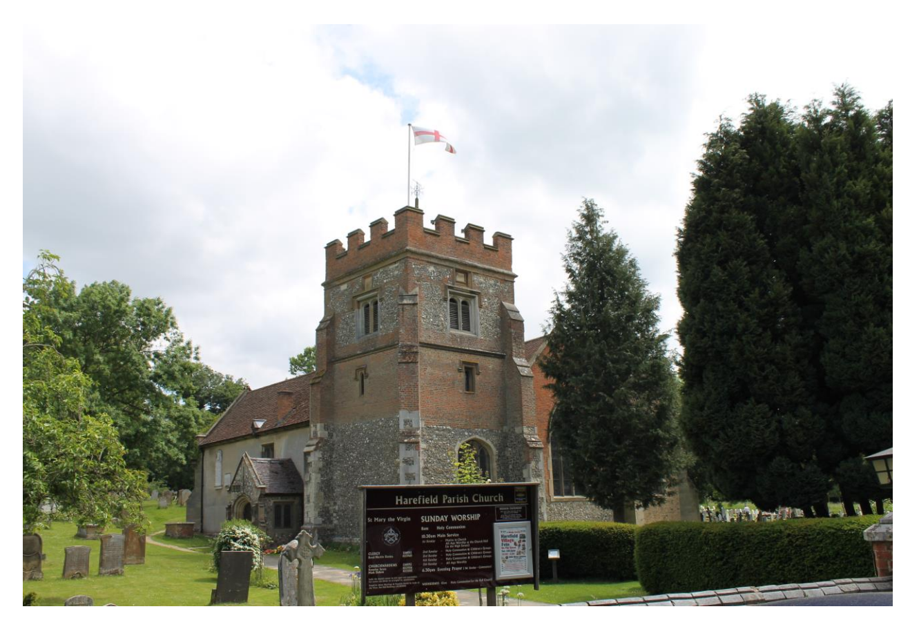
St Mary the Virgin Church, Harefield