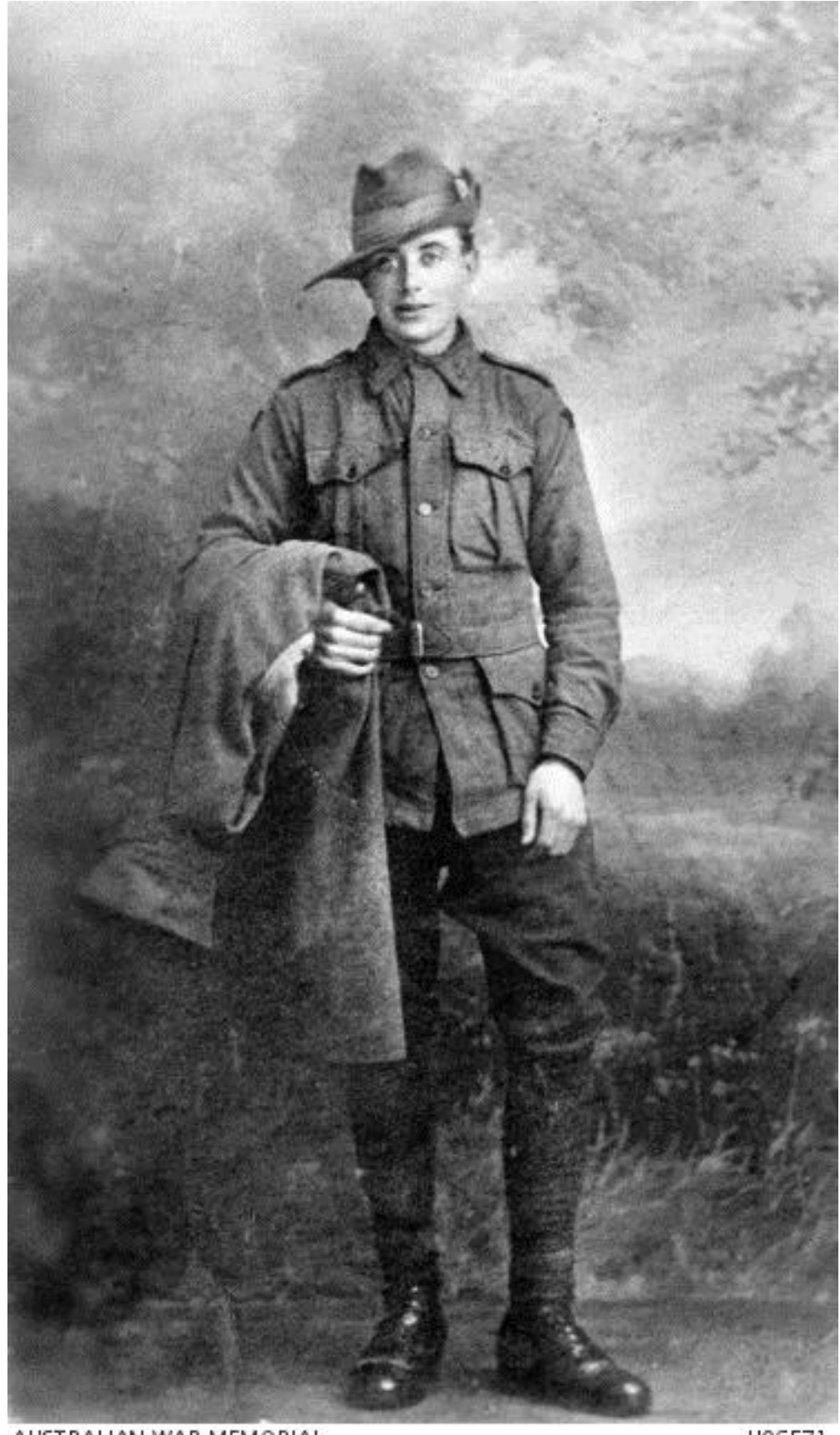
AUSTRALIAN WAR MEMORIAL