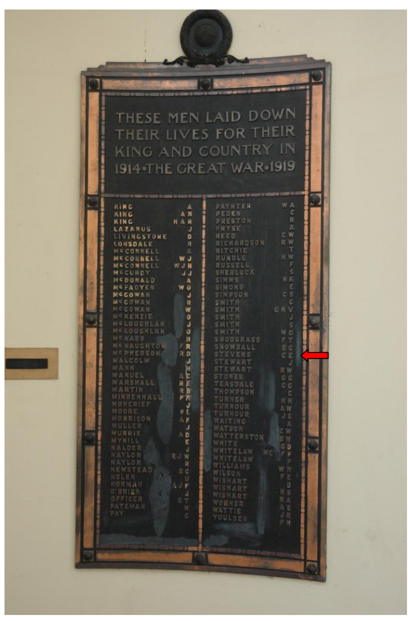
Kerang Shire Honour Roll