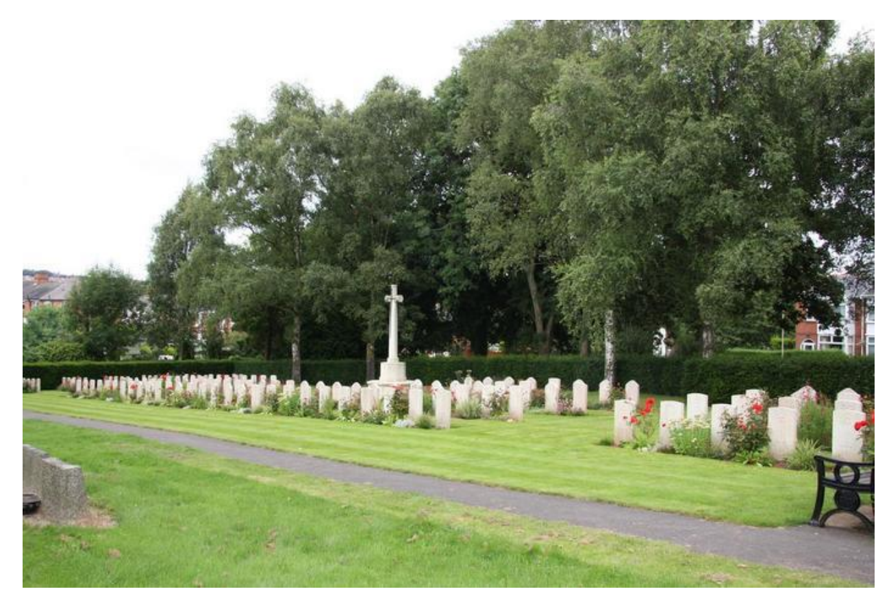
Exeter Higher Cemetery showing Cross of Sacrifice & World War 2 War Graves

An example of the plaques with the names of the soldiers buried in the World Ward 1 plot.