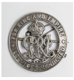
Silver War Badge

The Silver War Badge was issued in the United Kingdom and the British Empire to service personnel who had been honourably discharged due to wounds or sickness from military service in World War I. The badge, sometimes known as the "Discharge Badge", the "Wound Badge" or "Services Rendered Badge", was first issued in September 1916, along with an official certificate of entitlement. The large sterling silver lapel badge was intended to be worn on civilian clothes.