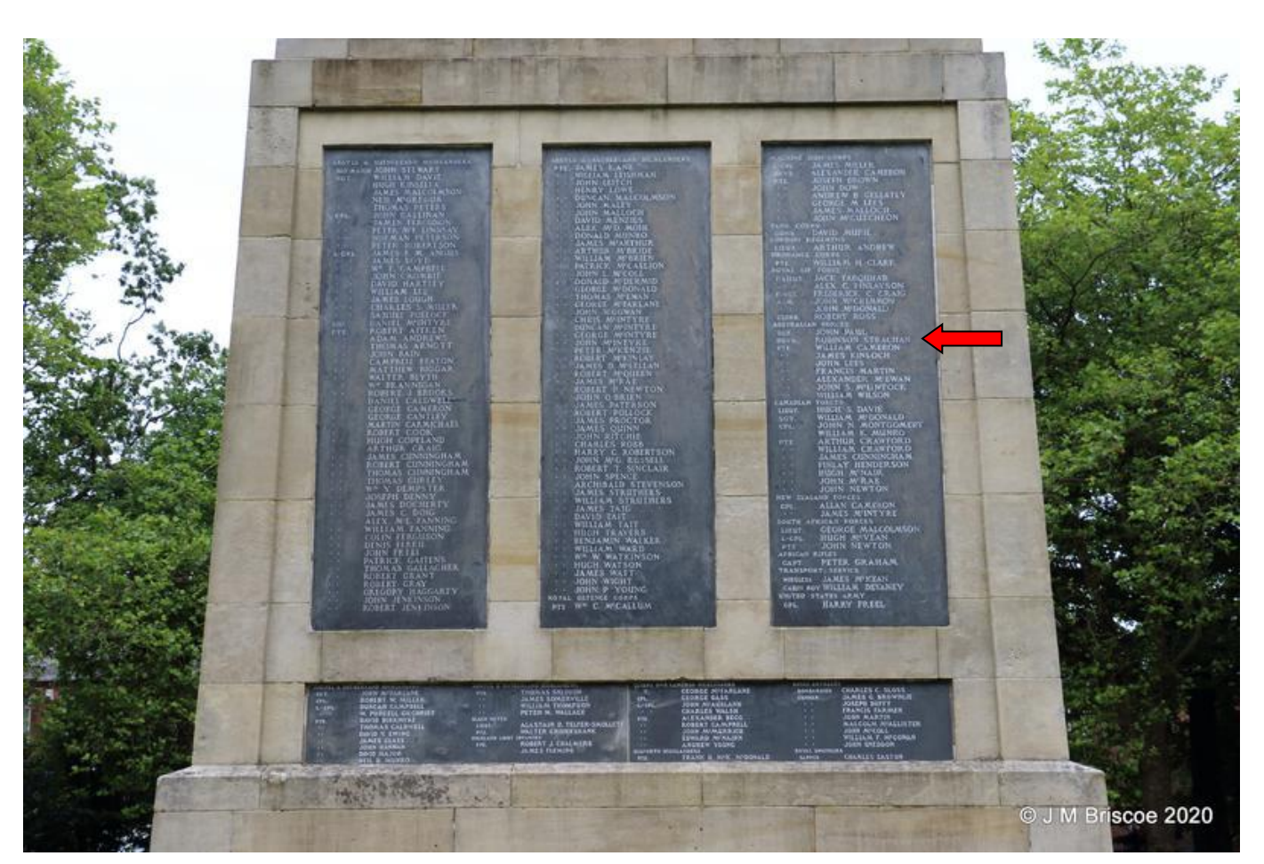
Alexandria / Bonhill/ Vale of Leven Parish War Memorial