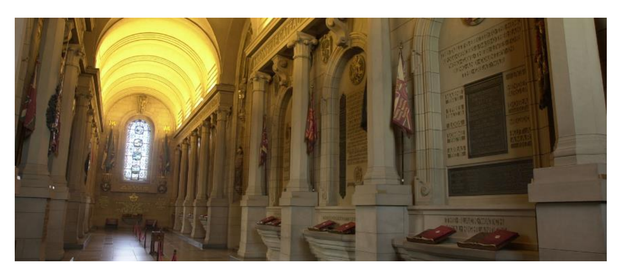
The Hall of Honour & the Roll of Honour Books.