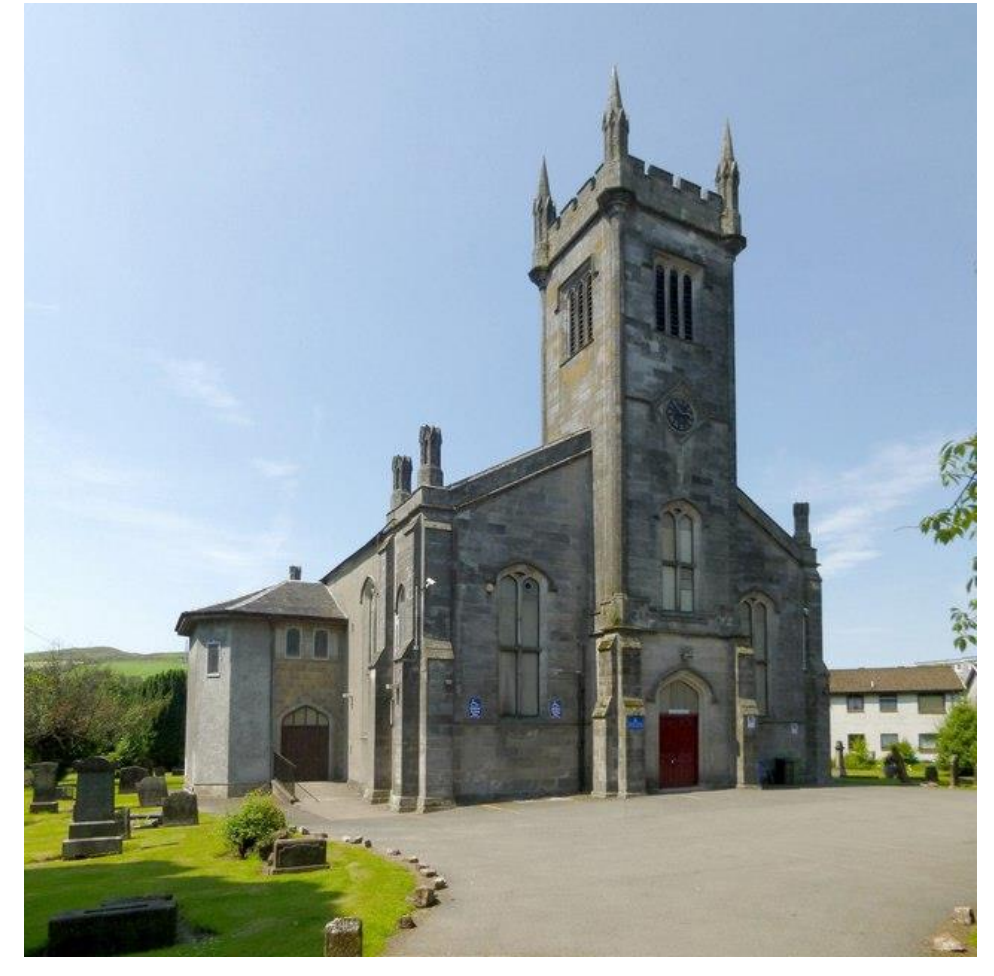
Bonhill Parish Church

Bonhill Parish Churchyard, Dunbartonshire contains 4 Commonwealth War Graves – 3 relating to World War 1 & 1 from World War 2.