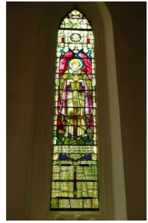
Holy Trinity Church, Salcome

Conrad De Courcy Stretton is remembered in a glass stained window located in Holy Trinity Church, Salcome, South Hams, Devon, England.