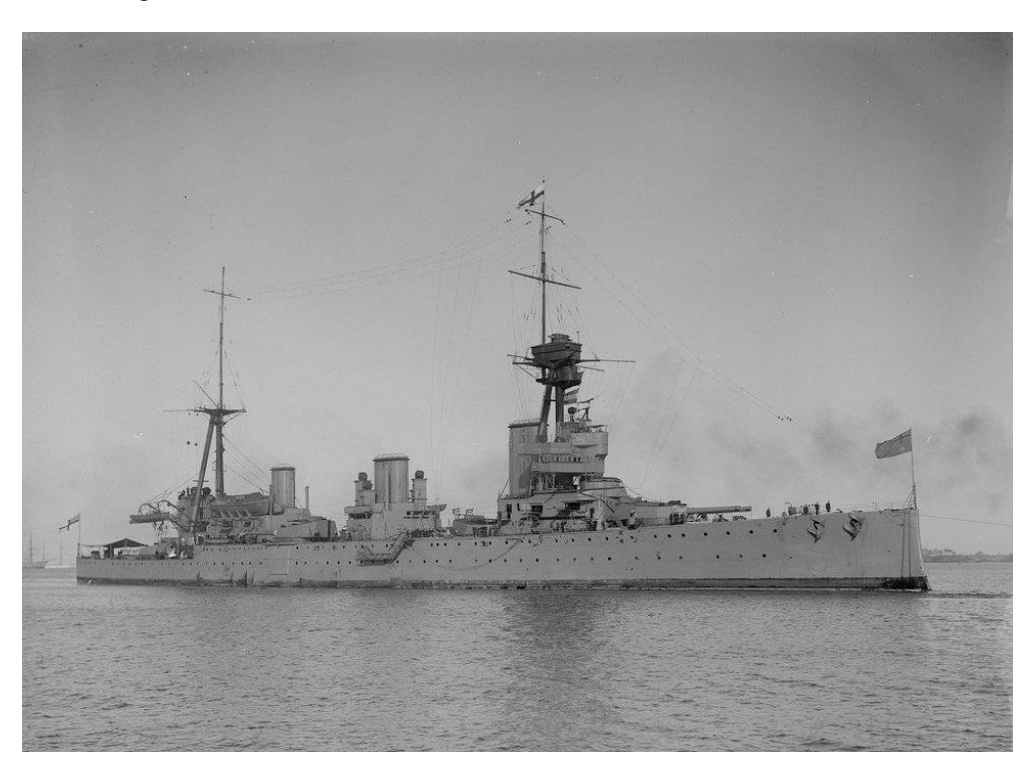
H.M.A.S. Australia 1914

In late December, 1914 Australia received orders to sail to England via the Pacific and reached Devonport on 28th January, 1915. En route she captured and sank von Spee's supply ship Eleonore Woermann off South America. From Devonport Australia proceeded to Rosyth in Scotland, where in February, 1915 she became flagship of the 2nd Battle Cruiser Squadron. The squadron, as initially formed, comprised Australia and her two sister ships, HMS New Zealand and HMS Indefatigable .