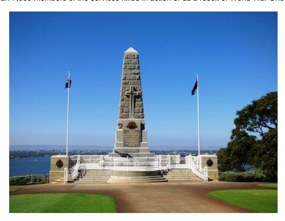
Western Australia State War Memorial Cenotaph, Kings Park

The heavy concrete foundations are supplemented by heavy brick walls which enclose an inner chamber or crypt. The walls surrounding the crypt are covered with The Roll of Honour; marble tablets which list under their units the names of more than 7,000 members of the services killed in action or as a result of World War One.