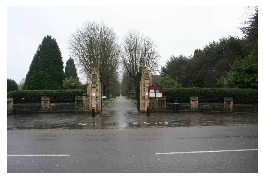
Entrance to Hatfield Road Cemetery, St. Albans