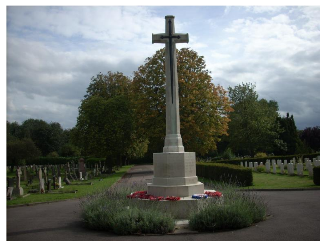
Cross of Sacrifice