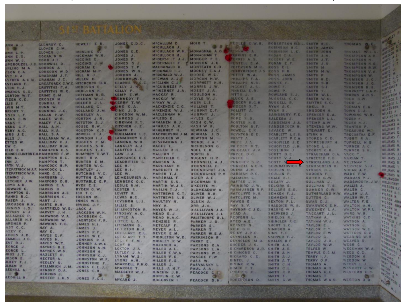
51st Battalion Panel