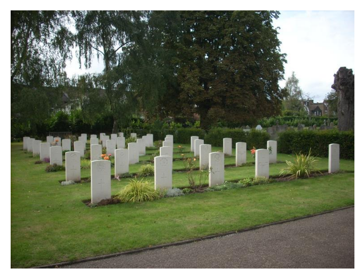
War Graves in Hatfield Road Cemetery, St. Albans